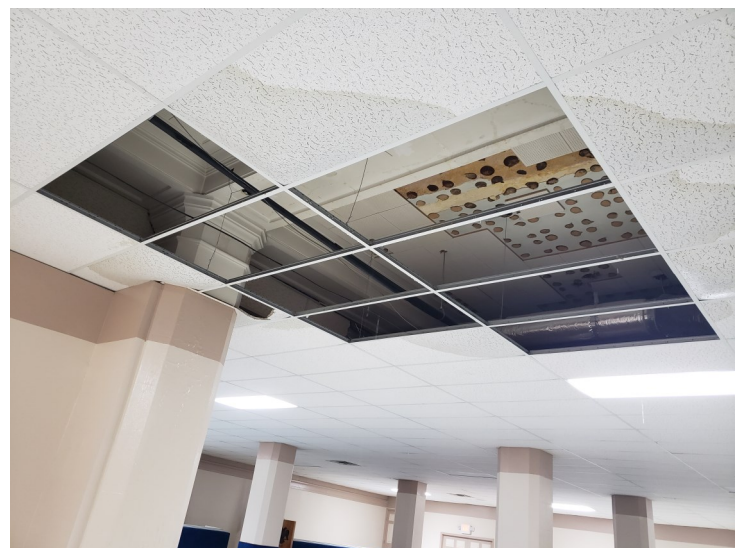
Dining Room Ceiling Damage caused by a broken drain line and repaired by our volunteer work group.