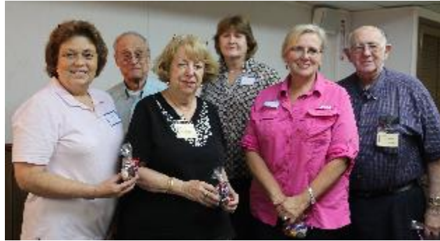
Happy birthday and welcome to our guest!