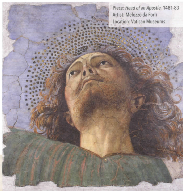
Piece: Head of an Apostle , 1481-83

Do I make getting to know our Lord in prayer a priority?