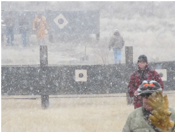
Snowy Sunday with targets posted at 100 and 200 yards