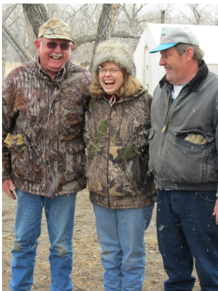
Top scorers yuk it up for us mortals