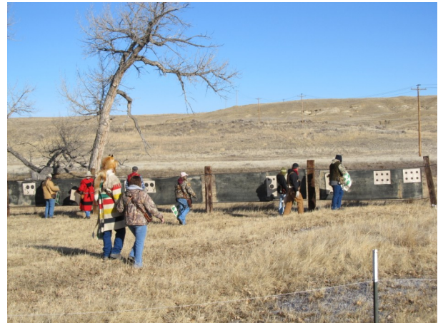
Forty-six shooters enjoyed a balmy Saturday morning on the DCML range