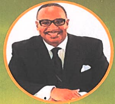
Bishop Sir Walter