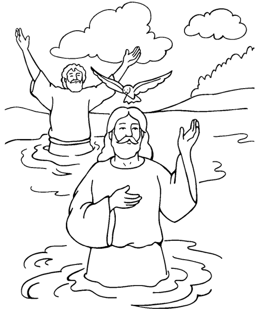
John Baptizes Jesus Matthew 3, Mark 1, Luke 3