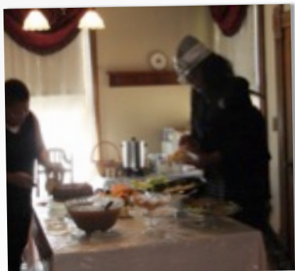
ENJOYING A DELICIOUS MEAL