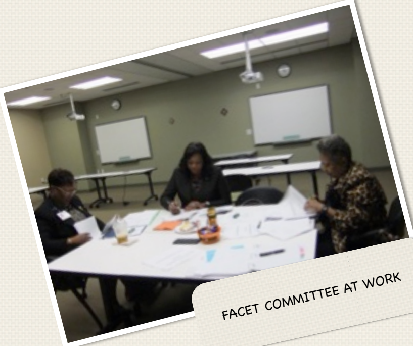
FACET COMMITTEE AT WORK

THE HEALTH AND HUMAN SERVICES FACET HAS BEEN VERY BUSY MEETING AND PLANNING THE KICKOFF OF THE CHAPTER'S UMBRELLA PROGRAMMING INITIATIVE-- CHILDHOOD OBESITY PREVENTION. ALL FACETS WILL PARTICIPATE. EACH CHAIR OF THE FACET WILL SUBMITTED PLAN TO IMPLEMENT THAT FACET'S PORTION OF THE INITIATIVE. THE KICKOFF DATE IS PLANNED JANUARY 2012. THIS WILL BE AN ON-GOING PROJECT. PLANS ARE TO PARTNER WITH THE COMMUNITY WITH THIS INITIATIVE.