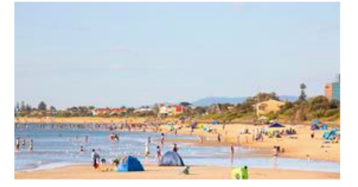
Frankston 26- 28 January 2018