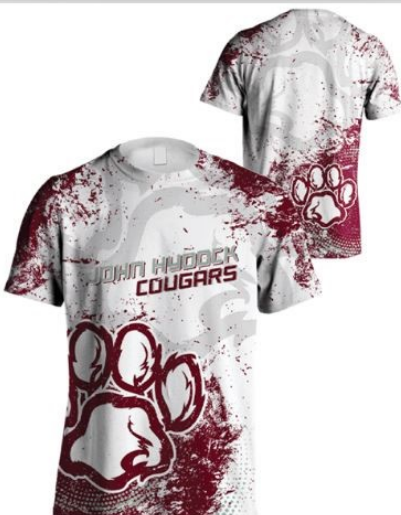
YTH/ADULT DYE SUB SPLATTER