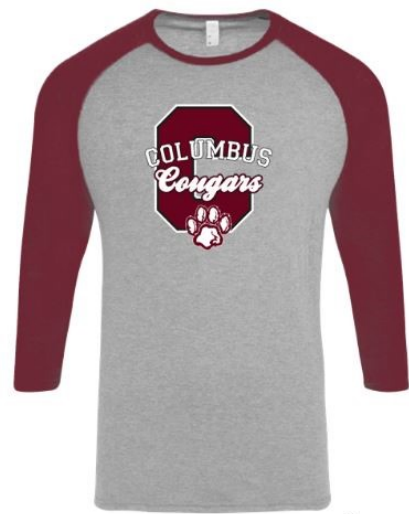
YOUTH/ADULT BASEBALL TEE