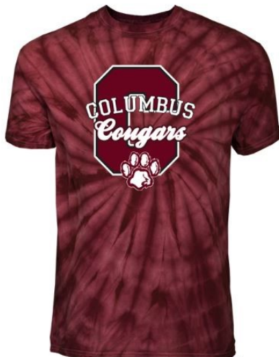
YOUTH/ADULT SPIDER TIE DYE