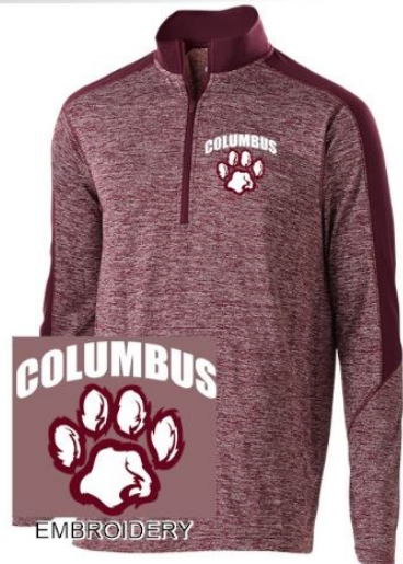
M/W/Y 1/2 ZIP