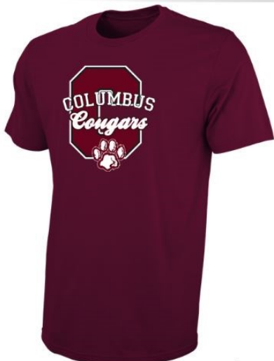
YOUTH/ADULT 50/50 TEE