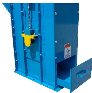
Standard easy cleanout system