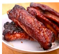
BBQ Spare Ribs