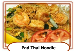
Pad Thai Noodle