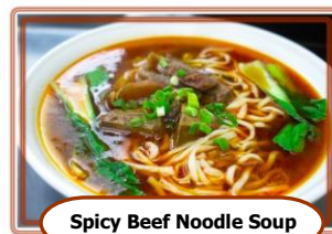
Spicy Beef Noodle Soup