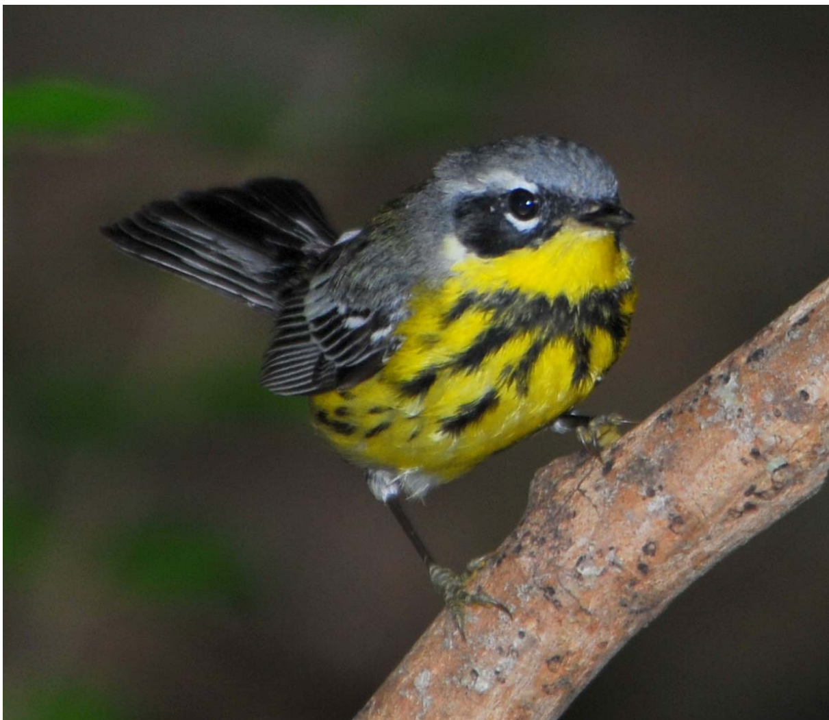
Magnolia Warbler (Boy Scout Woods)