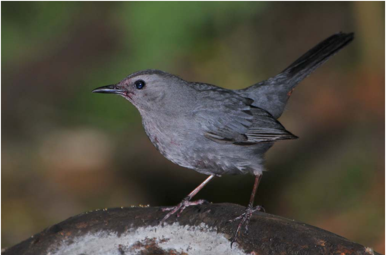
Gray Catbird (Boy Scout Woods)