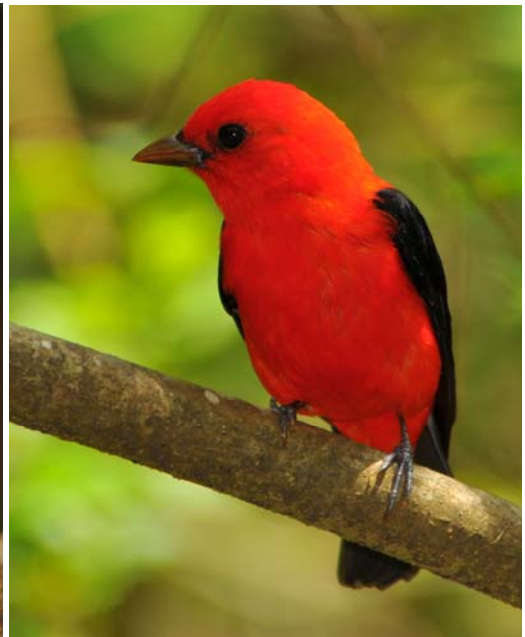
Immature Blue Grosbeak (Boy Scout Woods); Scarlet Tanager (Boy Scout Woods)