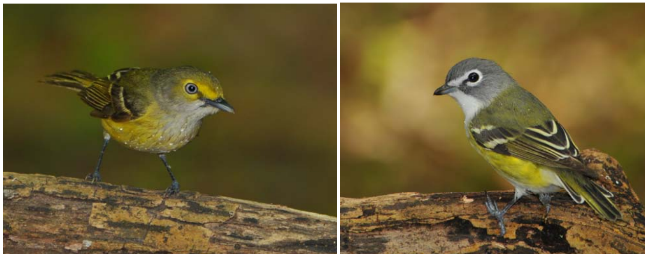
White-eyed Vireo (Boy Scout Woods); Blue-headed Vireo (Boy Scout Woods)

Travelling with favourable, southerly tailwinds the vast majority of migrants generally fly beyond the coastal zone, eventually stopping at dusk in more inland woodland and forests, before potentially continuing in the following days their onward journey towards breeding grounds. Even under these conditions, however, some of the migrants - the hungrier, slower, weaker or less pressed for time? - land in the first woodland that they encounter. Accordingly, good concentrations of migrants are often found in the few remaining coastal woodlots along the Texas coast at sites such as High Island, 1½ to 2 hours drive east of Houston, where several pockets of woodland are protected and managed by the Houston Audubon Society and Texas Ornithological Society.