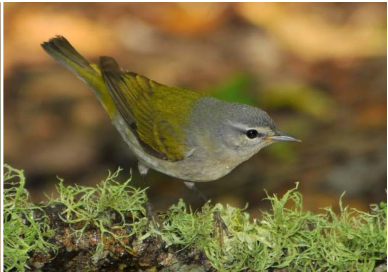
Swainson's Thrush (Boy Scout Woods); Tennessee Warbler (Boy Scout Woods)