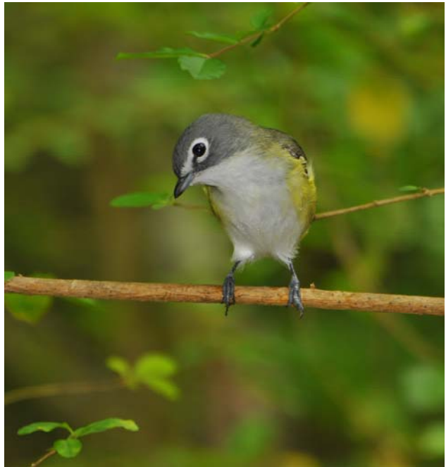
Immature Summer Tanager (Boy Scout Woods); Blue-headed Vireo (Boy Scout Woods)