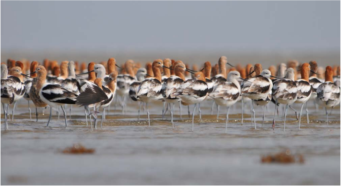
American Avocets in breeding plumage (Bolivar Flats)