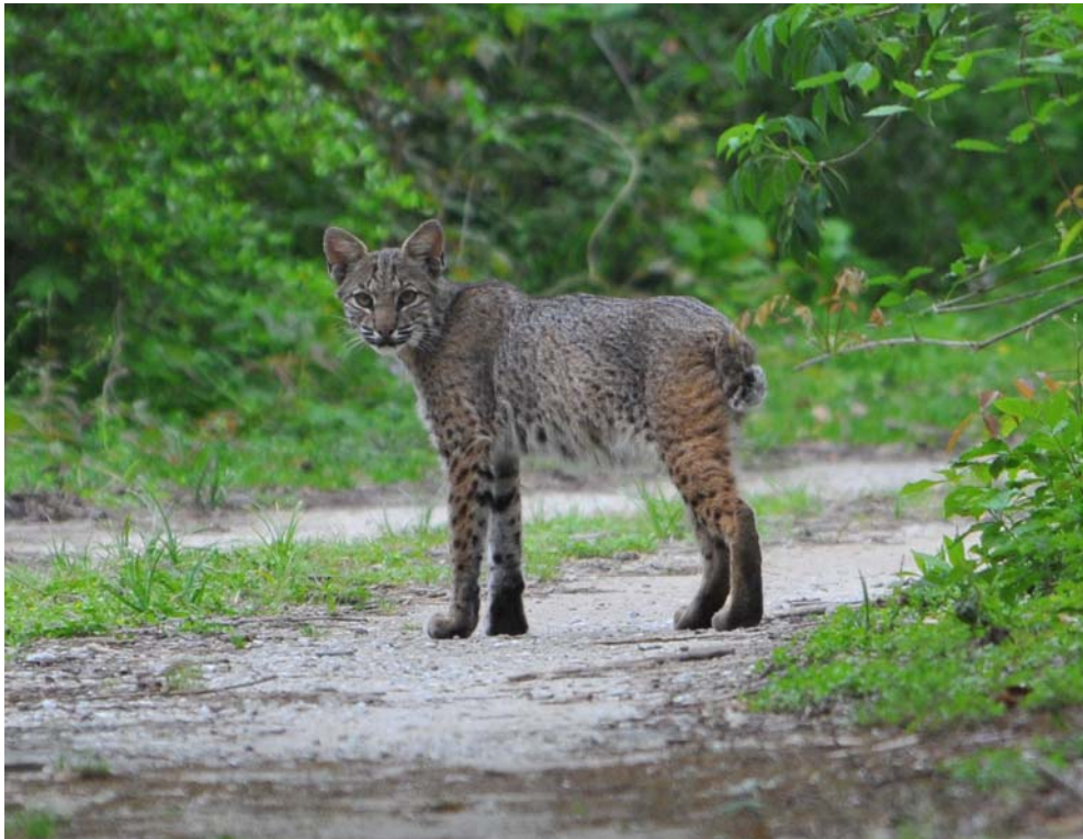
Bob Cat (Smith Oaks)

Although this marathon open-water crossing by birds typically weighing from only 8g to 30g is impressive enough under the most favourable of conditions, each day's flight departing from Mexico is also subject to the vagaries of wind and weather conditions encountered across the Gulf. Several times during each migration season (about once or twice a fortnight during 2008) cold fronts from the north push down through Texas and offshore into the Gulf, bringing with them rain and northerly winds. Confronted by challenging headwinds, a higher proportion of the birds migrating on those days tend to set down in the coastal woodlots, so locations like High Island can be teeming with migrants recovering from their arduous crossing. These weather dependent days when 'fall-outs' of migrants occur are no doubt feared by the birds themselves, but can treat Texas birders to close-up views of myriad newly arrived migrants as they 'drop' into the trees and bushes around them. Peak days this season included observations of at least 25 warbler species in the few hectares of High Island woodlots! Whilst morning birding in the coastal woodlots offers the chance to catch up with the resident birds plus any migrants who stayed the night before continuing their journey, afternoon birding can often be superior as waves of new arrivals progressively add to the numbers of birds to be found.