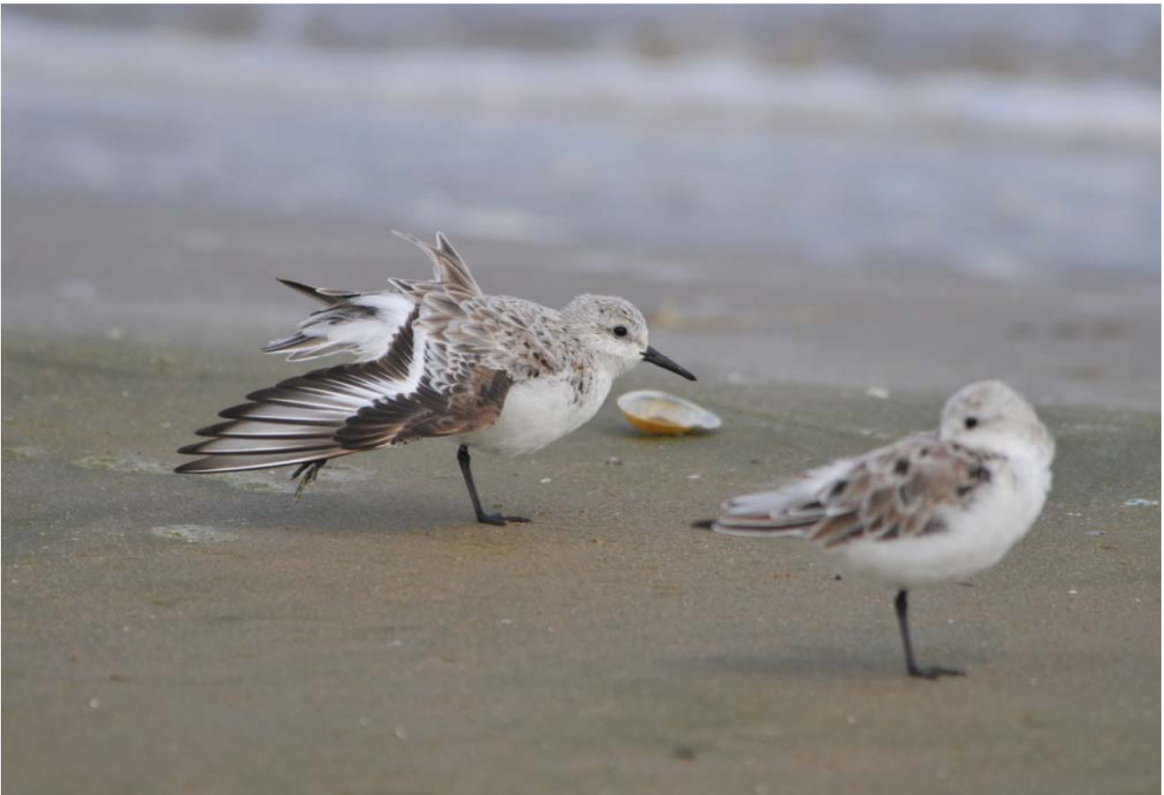
Sanderlings (Bolivar Flats)