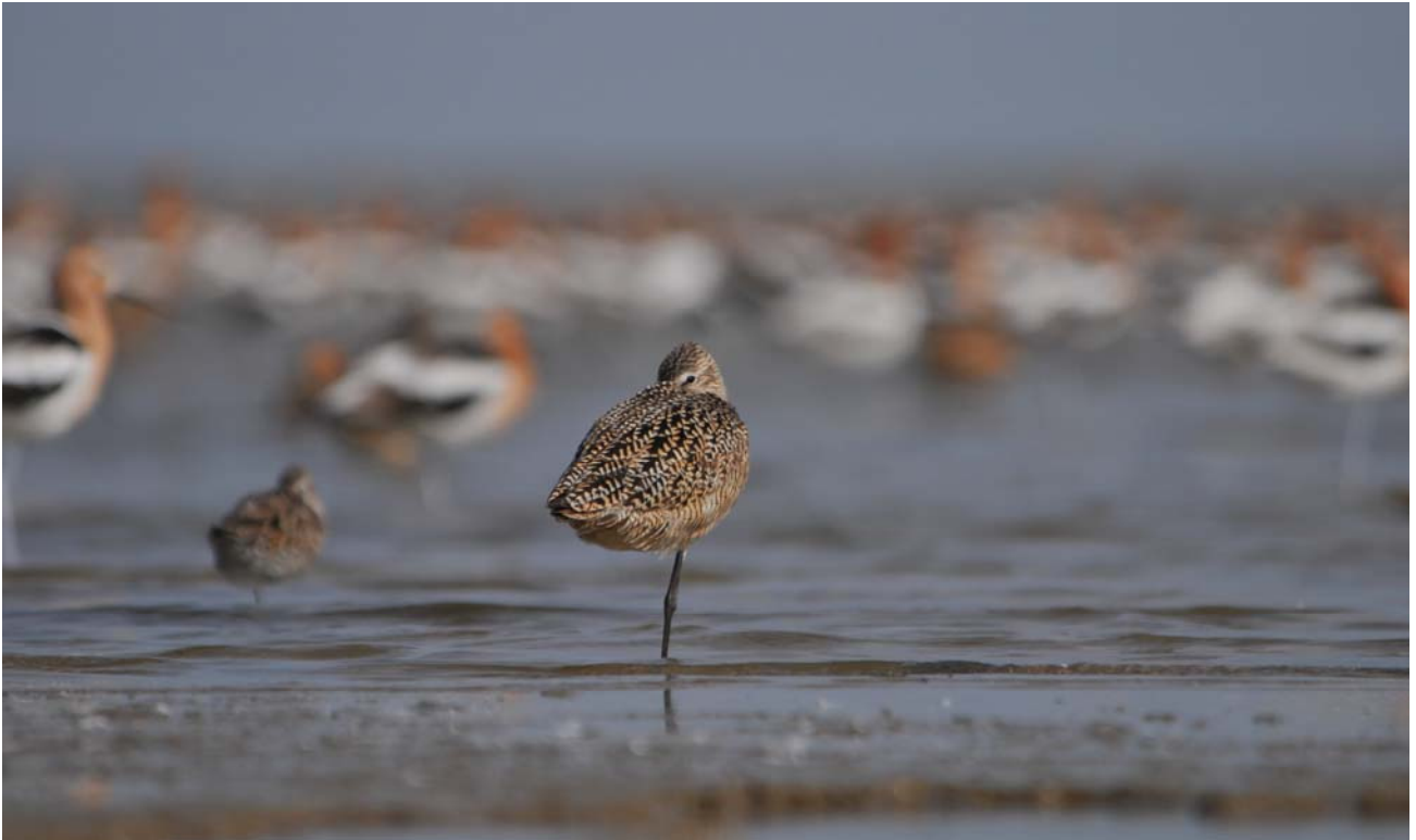
Marbled Godwit and American Avocets (Bolivar Flats)