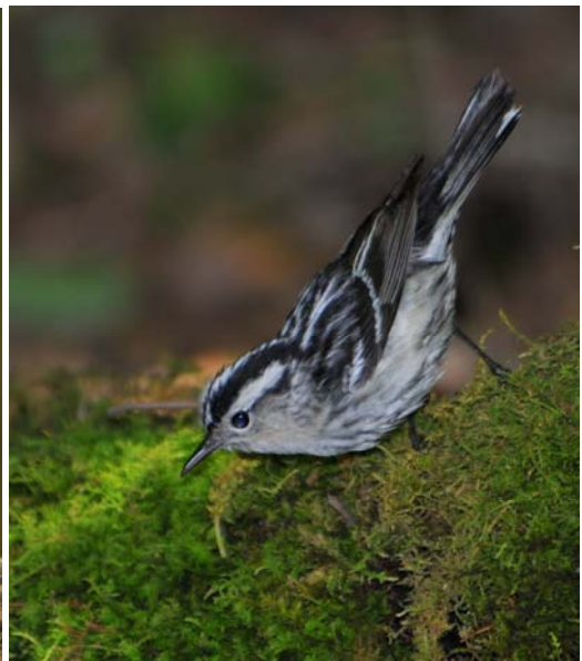
Hooded Warbler (Boy Scout Woods); Black-and-white Warbler (Boy Scout Woods)