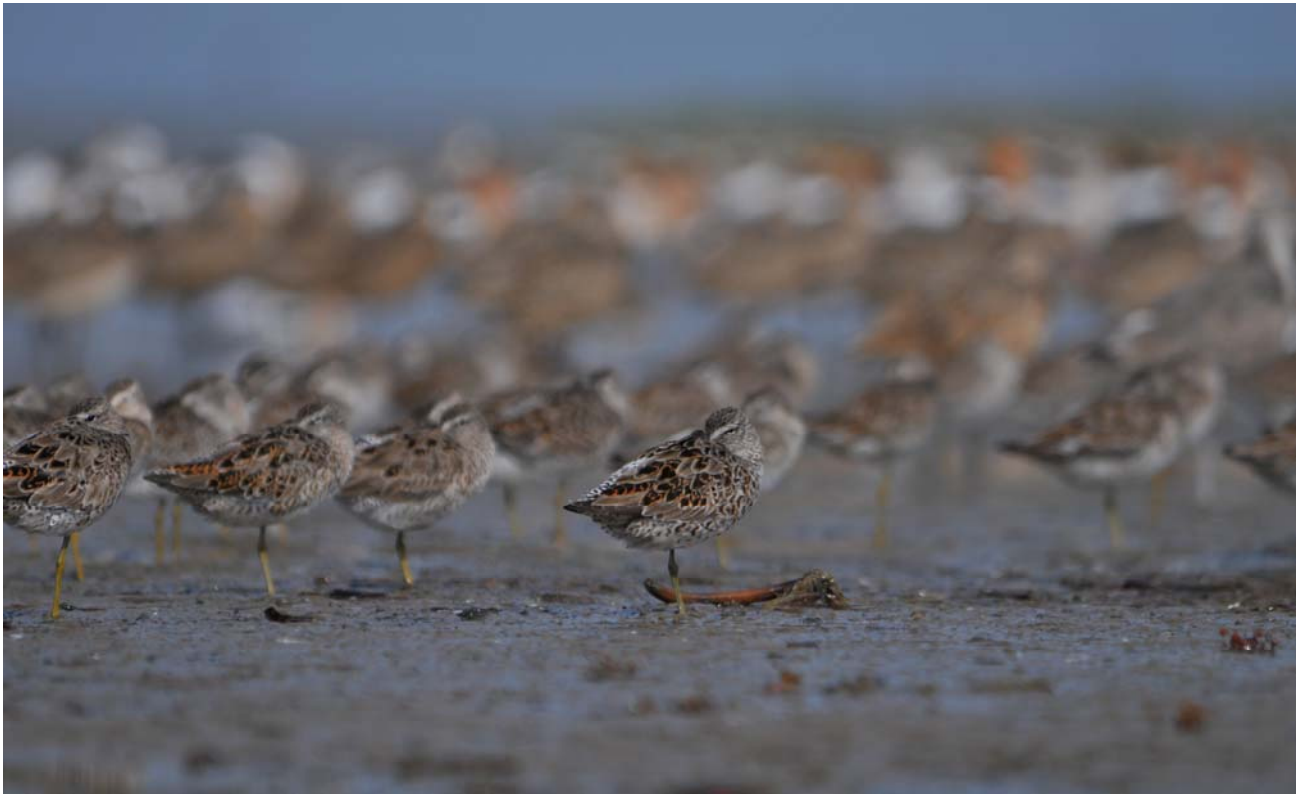
Short-billed Dowitchers (Bolivar Flats)