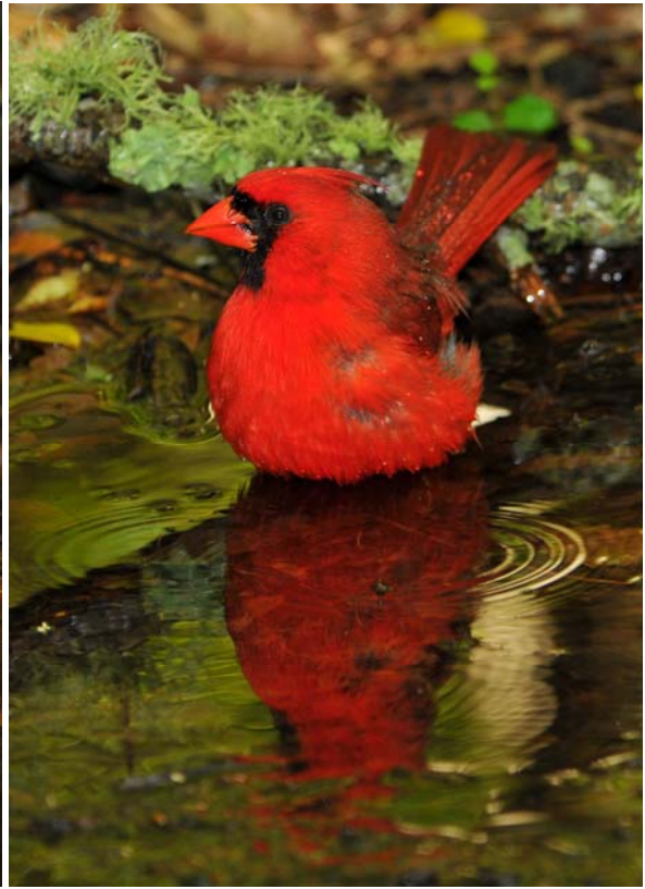
Rose-breasted Grosbeak (Boy Scout Woods); Northern Cardinal (Boy Scout Woods)

For those interested in more details of this season's observations at High Island, I recommend checking out http://www.birdinghighisland.com which in the 'Bird News' section includes a daily blog chronicling the 2008 migration season. This site is one of the beneficial outcomes of a new, symbiotic alliance between Tropical Birding/Birding America and Houston Audubon Society (HAS) through which Tropical Birding provided several professional guides as volunteers for free guided walks around HAS's High Island and Bolivar flats sites, an observation tower, a reference library and even free coffee to visitors. In return, Tropical Birding was well positioned to access thousands of potential new clients passing by the front door of their information centre (adjacent to HAS' Boy Scout Woods entrance) and interacting with their volunteer guides on the daily walks.