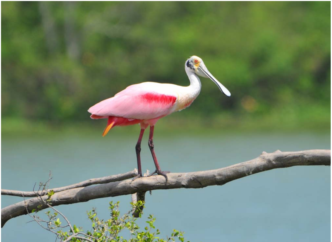
Roseate Spoonbill in breeding plumage (Smith Oaks)