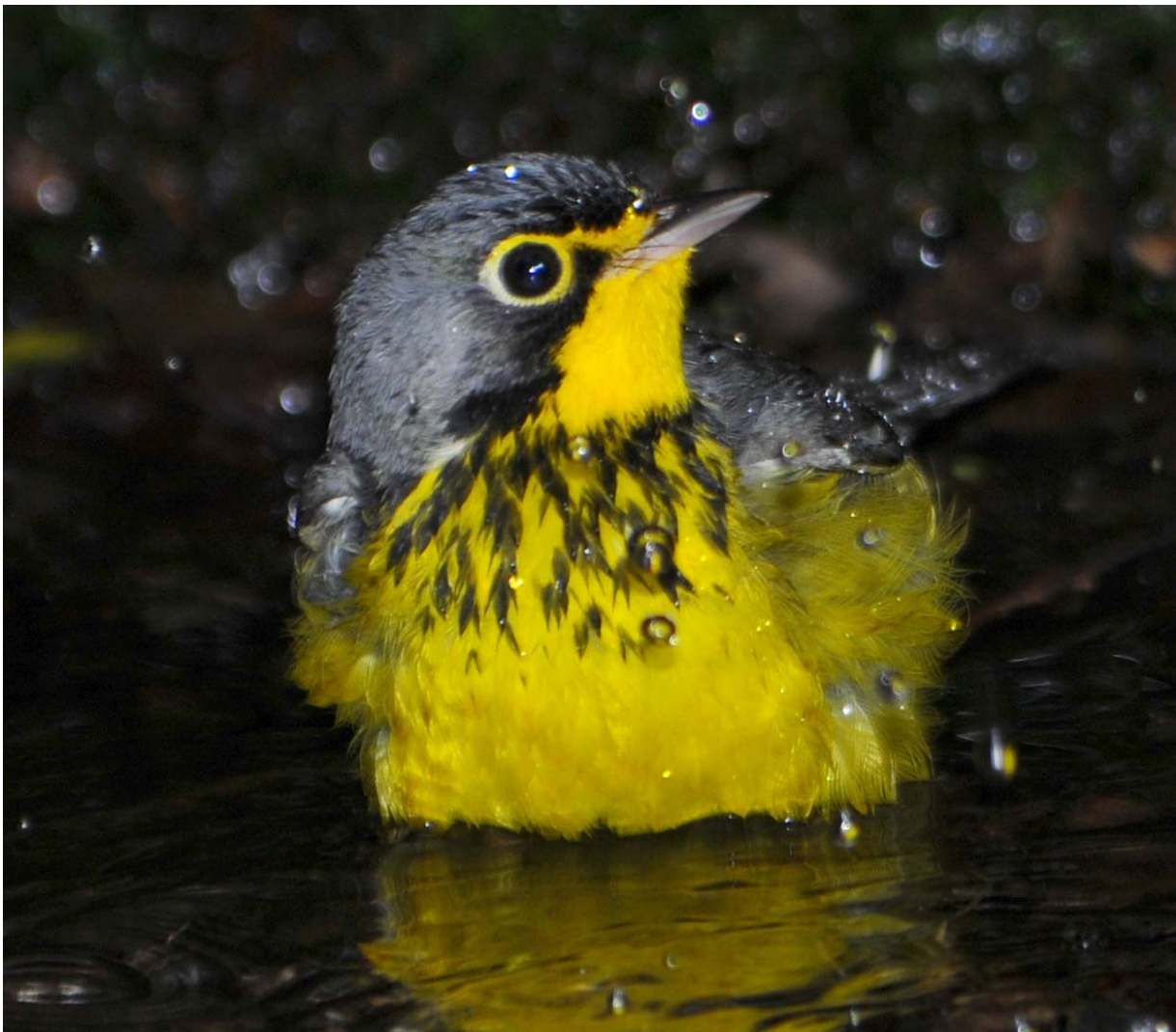
Canada Warbler (Boy Scout Woods)