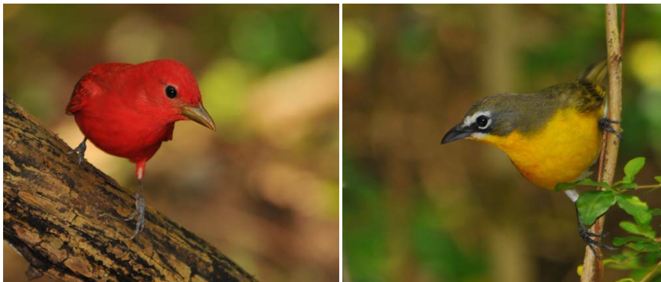
Summer Tanager (Boy Scout Woods); Yellow-breasted Chat (Boy Scout Woods)

Spring in coastal Texas is synonymous with the annual arrival of neotropic migrant warbler, tanager and other species returning to breed in North America after wintering in Central and South America. With one of the main migration routes connecting the Yucatan peninsular to the Texas coastline - via some 18 hours flight on a northerly path across the Gulf of Mexico - Houston is well located for observing this phenomenon. The wave of migrants commences slowly in March, peaks in April and tapers off again as summer arrives in May, with different mixes of species observed as the season progresses.