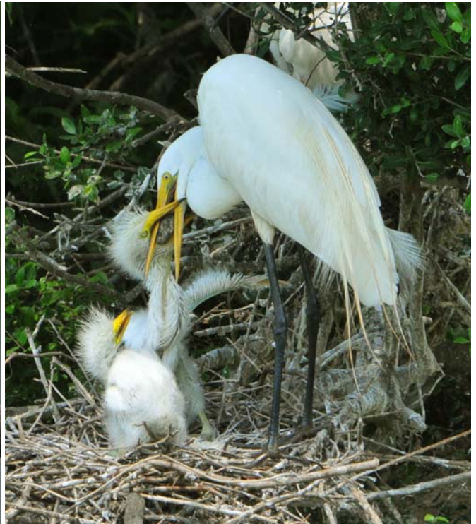
Great Egret grooming breeding plumage (Smith Oaks); Great Egret feeding chicks (Smith Oaks)