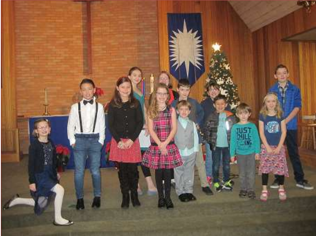
The Children's Christmas Program!