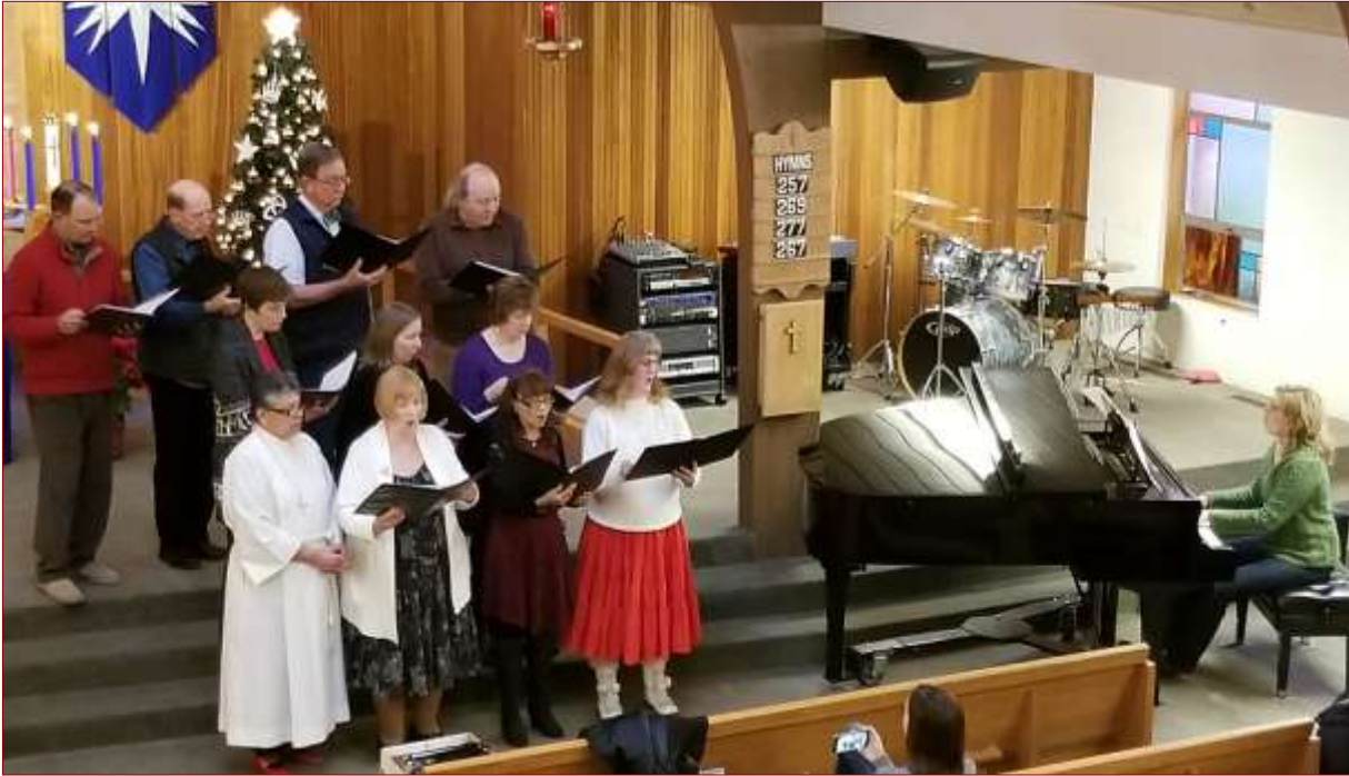
Choir singing on Christmas Eve morning