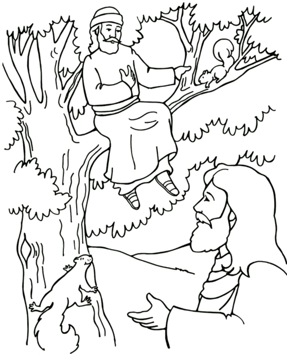
Jesus and Zacchaeus Luke 19

From Thru-the-Bible Coloring Pages for Ages 4-8. © Standard Publishing. Used by permission. Reproducible Coloring Books may be purchased from Standard Publishing, www.standardpub.com , 1-800-543-1301. Used by permission