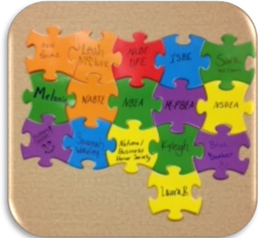
LDI members become part of the bigger picture.

The LDI 2014 group of nine are making a difference in our schools. Be sure to follow these leaders . They can make a difference in NSBEA too. If you see them, welcome them with open arms. NSBEA will be better because it.