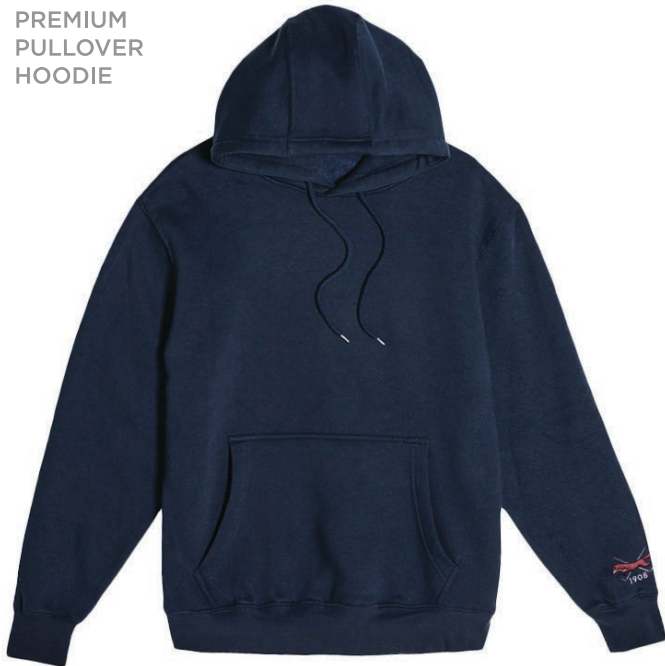
PREMIUM PULLOVER HOODIE