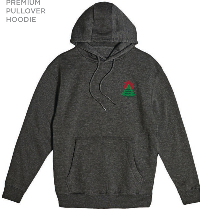
PREMIUM PULLOVER HOODIE