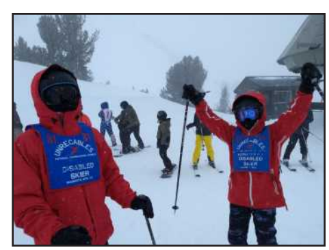
Fun in masses of snow in Mammoth in February.