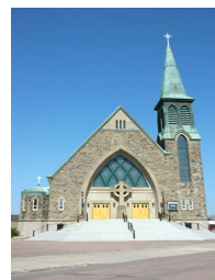
Saint Augustine's 340 Dominion Street Moncton, NB

September 24, 2017 Twenty-Fifth Sunday in Ordinary Time