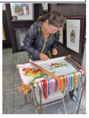
Artisan at work at Art Expo