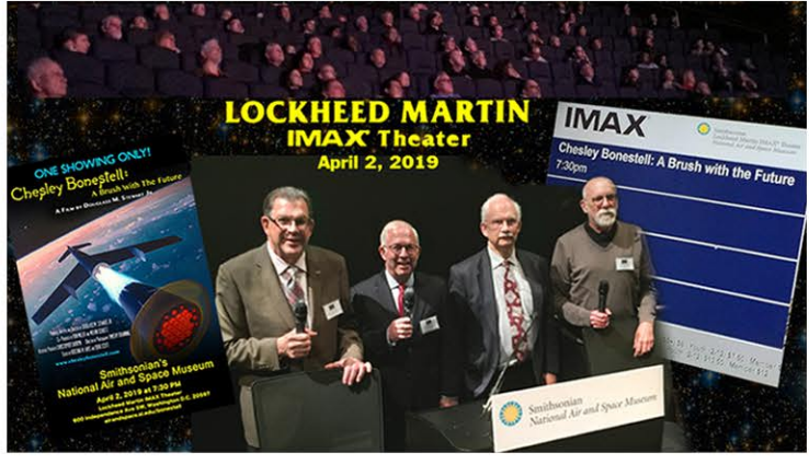
Smithsonian National Air and Space Museum - April 2019