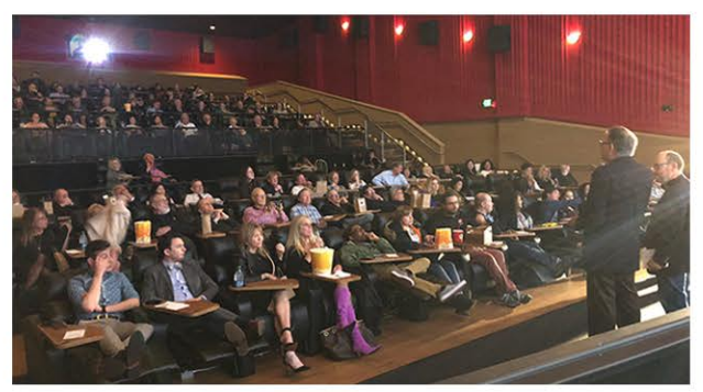
Newport Beach Film Festival - May 2018