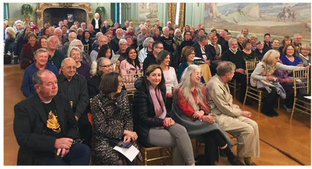
Filoli Historic Trust - March 2019