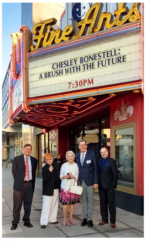
Ahrya Fine Arts Theatre - August 2019