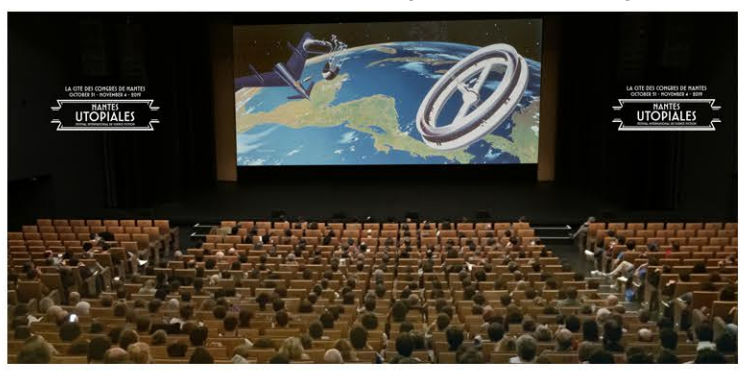
Les Utopiales Festival de Science-Fiction - Nantes, France