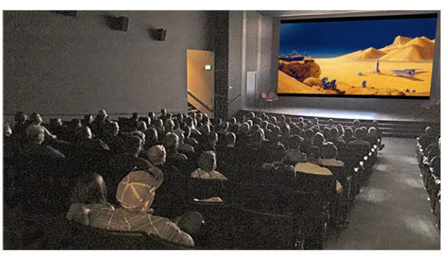
Seattle Museum of Flight - August 2019