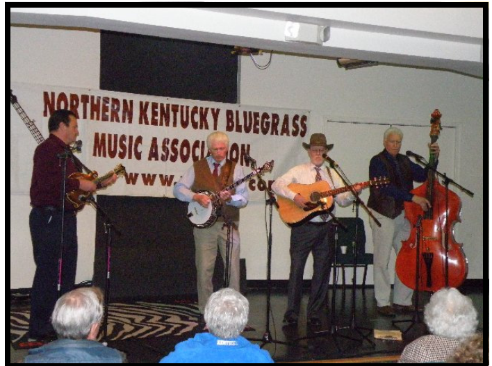
MFBGB Performing at a Willis Music event earlier this year