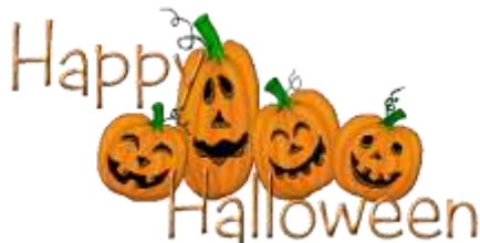
Iris Orellana Regent