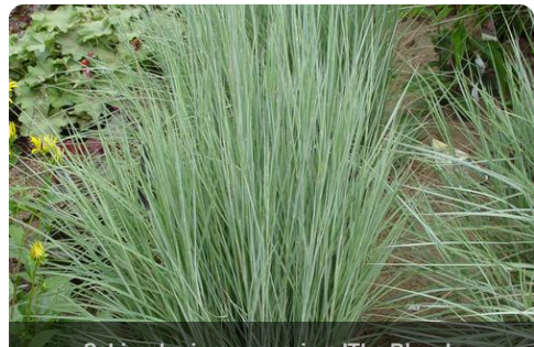
Schizachyrium scoparium 'The Blues'