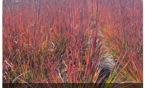
Schizachyrium scoparium 'Standing Ovation'