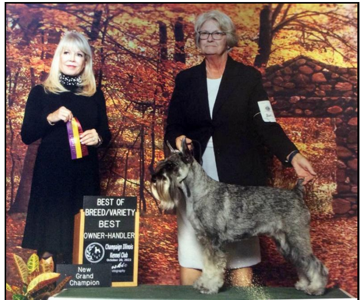
"Ana" Ch Katon's Here We Go Again v Morgenwald finished her GCH