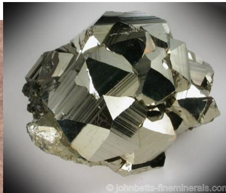
pyrite crystal specimen

*Notice to readers* if at any time you have any topic you would like to have printed in our monthly newsletter, please feel free to email me at ( lhellerwood82@msn.com )