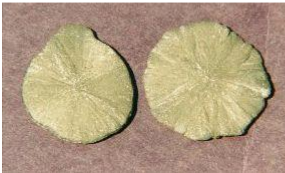
Pyrite dollar specimen

Pyrite is an extremely common mineral, and good examples occur in numerous localities throughout the world. In the U.S, Park City, Bingham Co., Utah, large, well shaped pyritohedrons and cubes were once found. The Bingham Canyon Mine, Salt Lake Co., Utah is also a classic occurrence, where few of the excellent Pyrites from the mine are saved from the mining crusher. Large, inter-grown cubes, many times partially octahedral, occurred in abundance at Leadville, Lake Co., Colorado. Pyrite "dollars" are well-known from Sparta, Randolph Co., Illinois. The French Creek Mine in Chester Co., Pennsylvania is famous for the octahedral crystals that occur there, although most are distorted. Ross Co., Ohio, produces rounded tubular growths of Pyrite, some reaching several feet in size, as well as growths of spiky, pineapple-like crystals.