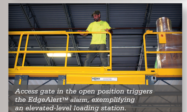
Access gate in the open position triggers the EdgeAlert™ alarm, exemplifying an elevated-level loading station.