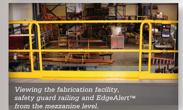
Viewing the fabrication facility, safety guard railing and EdgeAlert™ from the mezzanine level.