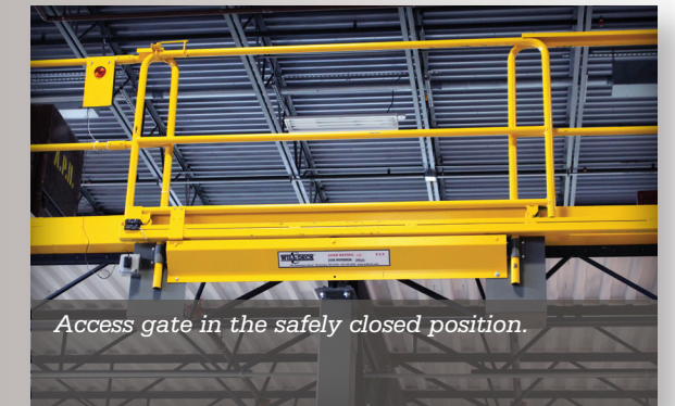
Access gate in the safely closed position.

"I was impressed by Wildeck's commitment to safety and their proactive approach to going above and beyond OSHA standards," Clancy explained. "The cost of installing the access gates armed with EdgeAlert™ is low, especially when you consider your workers' safety. Not to mention it lowers workman's compensation claims—EdgeAlert™ is a no-brainer."