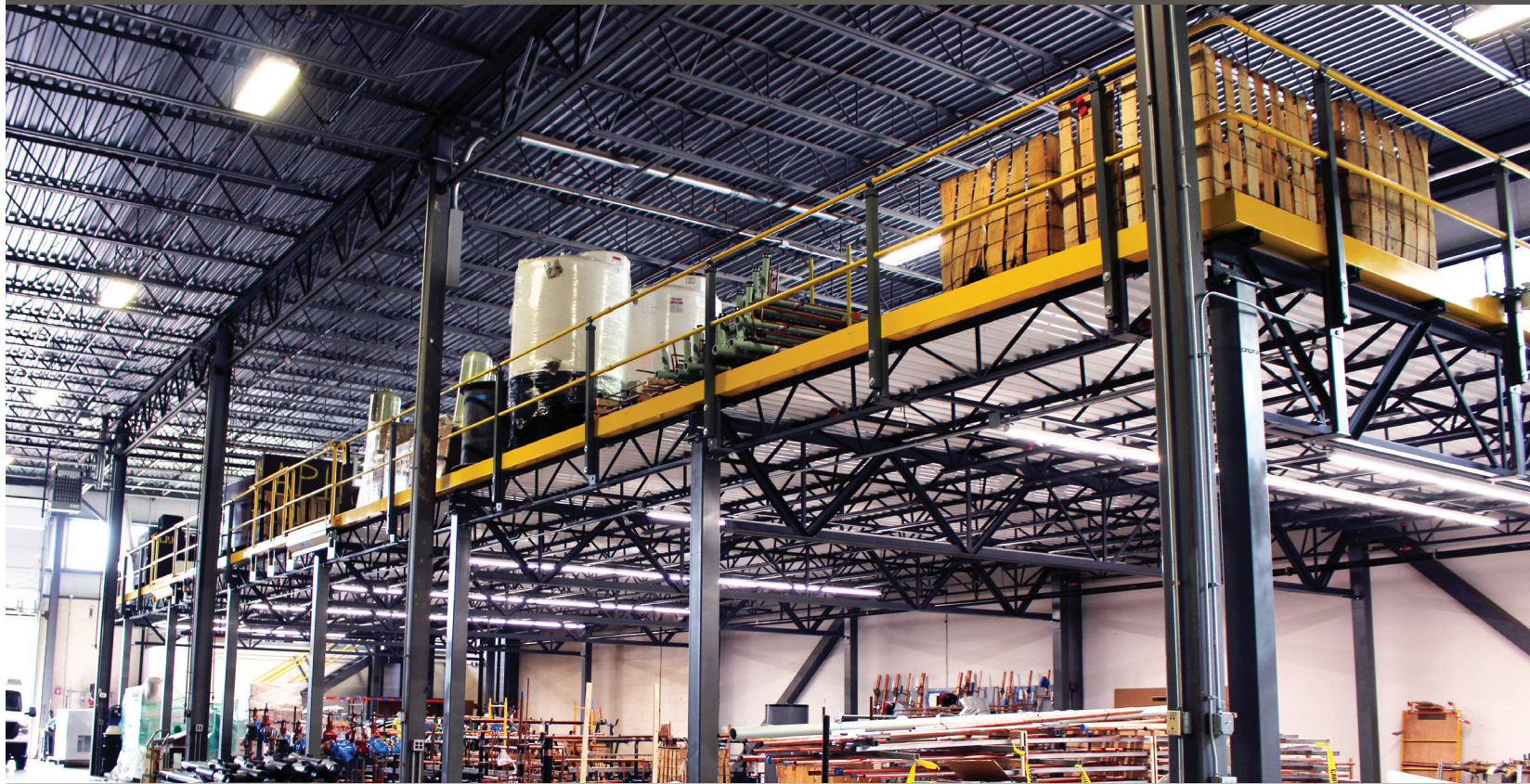
Since increasing employee safety is paramount at American Plumbing & Heating, the company insisted on installing EdgeAlert™ Open Gate Alarms on its new 4,284 square foot Wildeck® mezzanine platform. EdgeAlert™ warns of an open gate on a mezzanine by sounding a loud audible alarm and flashing amber light.

In a thriving economy, growth is as welcome as it is daunting. When it's time to expand your facilities, there are only a few options. American Plumbing & Heating knows this challenge well.