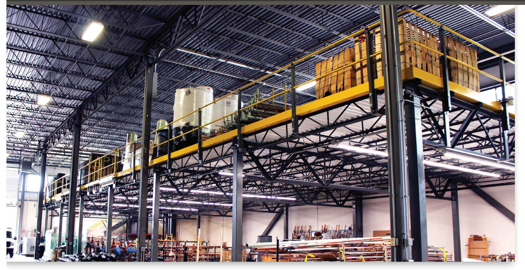
Since increasing employee safety is paramount at American Plumbing & Heating, the company insisted on installing EdgeAlert™ Open Gate Alarms on its new 4,284 square foot Wildeck<sup>®</sup> mezzanine platform. EdgeAlert™ warns of an open gate on a mezzanine by sounding a loud audible alarm and flashing amber light.

n a thriving economy, growth is as welcome as it is daunting. When it's time to expand your facilities, there are only a few options. American Plumbing & Heating knows this challenge well.