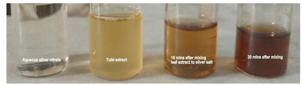
Fig. 2 Change in the colour of the solution with time when plant extracts are added to silver salt (Jain & Mehata, 2017).

required plant then boiled with water or ethanol to get aqueous plant extract. This plant extract in a fixed ratio is then incubated with desired amount of AgNO<sub>3</sub> solution. With the passage of time, the color changed from colorless to brownish due to surface enhanced properties of silver nanoparticles.