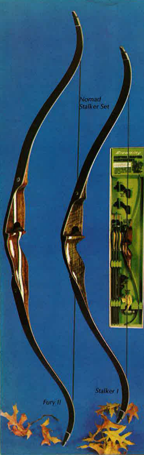
Nomad Stalker Set