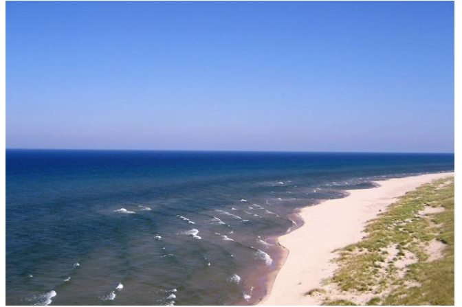
The view from the top of Big Sable Point Lighthouse. No, we couldn't see Wisconsin...