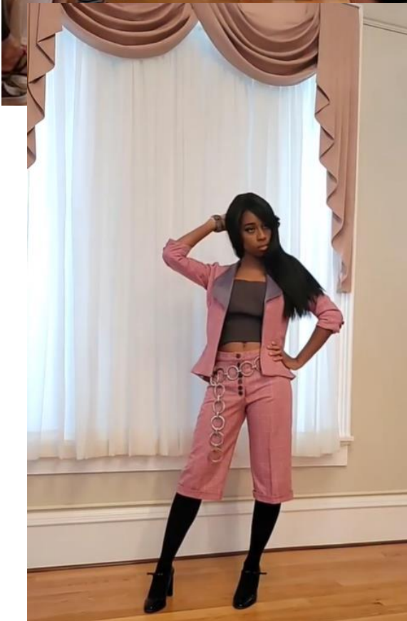
Some of our models....