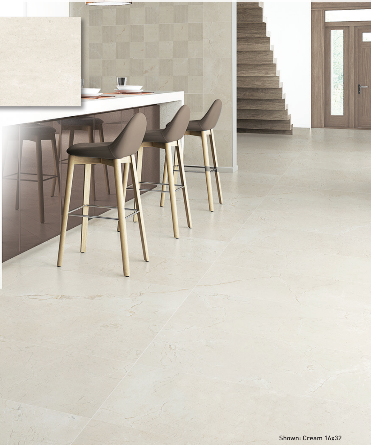
Shown: Cream 16x32