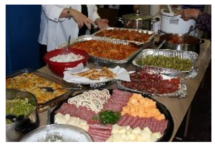
5th Sunday Fellowship lunch

December 29th is the 5th Sunday so please mark your calendar to bring your favorite food dish to share. Let's end 2019 with friends and family as we get ready for 2020.