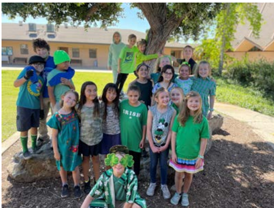
St. Patrick’s Day