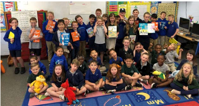
Dr. Seuss Week with the kindergartners, first grade, and second grade.

Our students were looking super cute in their green attire. We had everything from lime green tutus to oversized shamrock glasses. (I would imagine the grass looked exceptionally green through those!) It was a great day for the students to celebrate this holiday altogether.