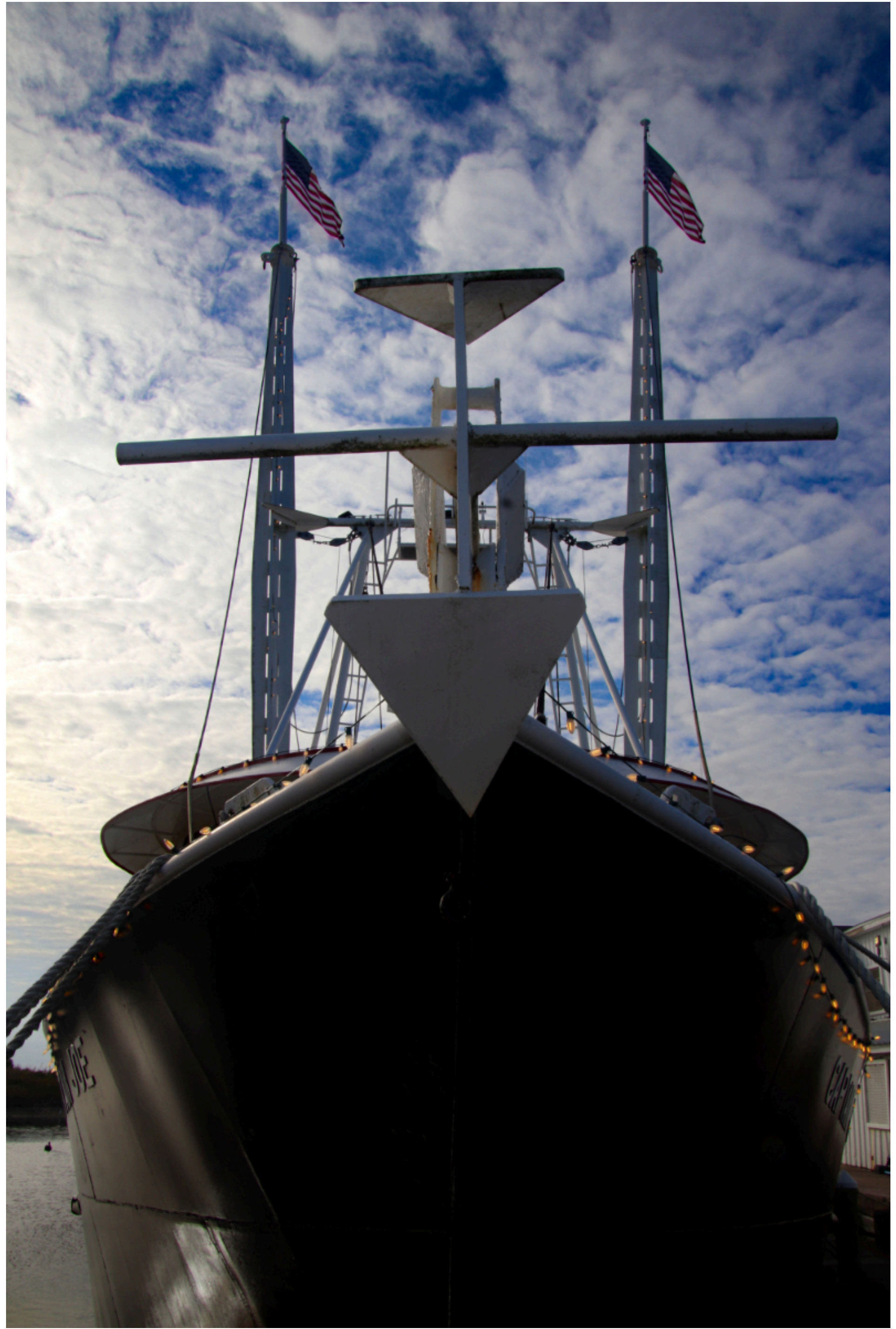
Entry - 15