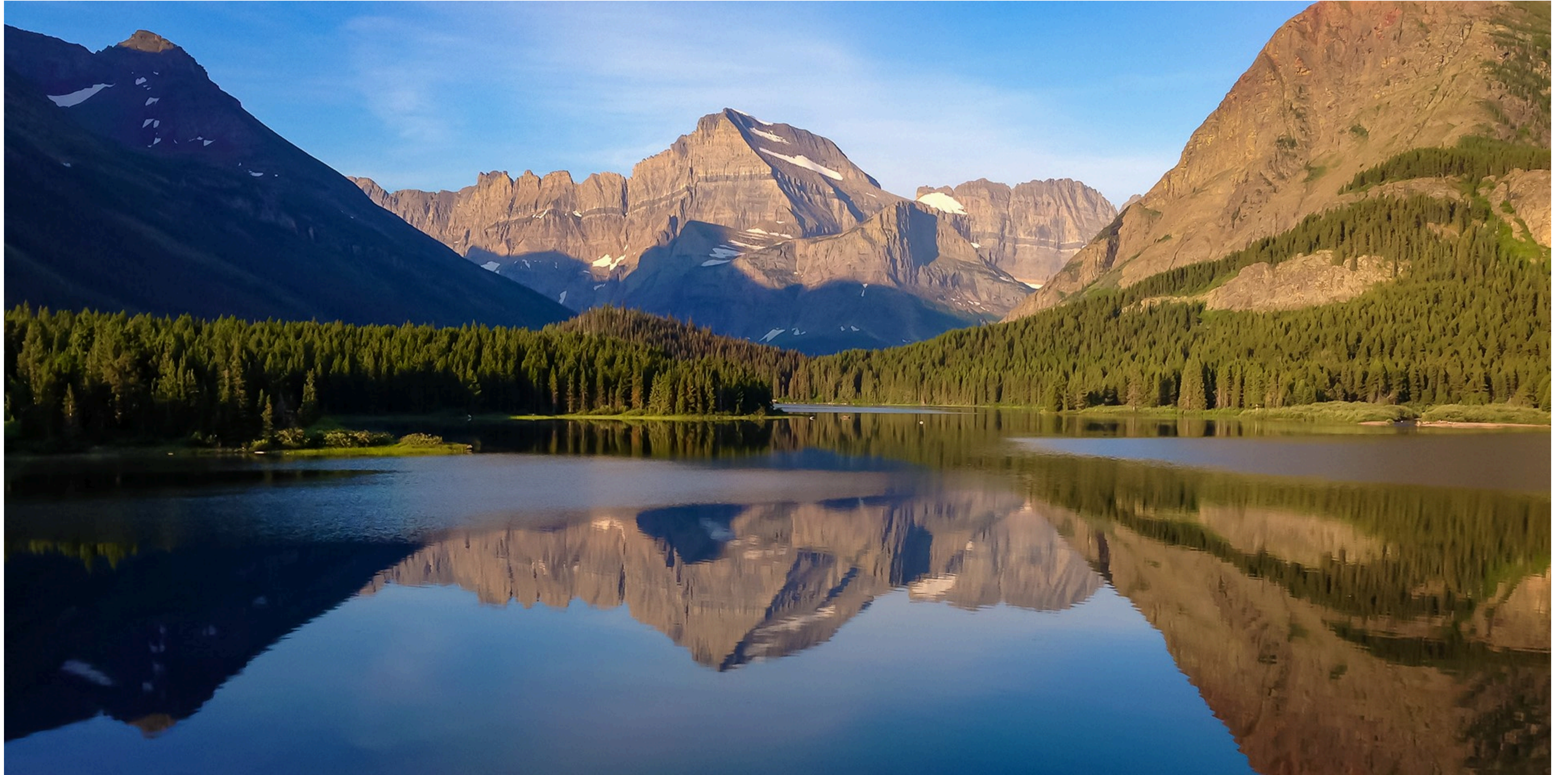
Entry - 7