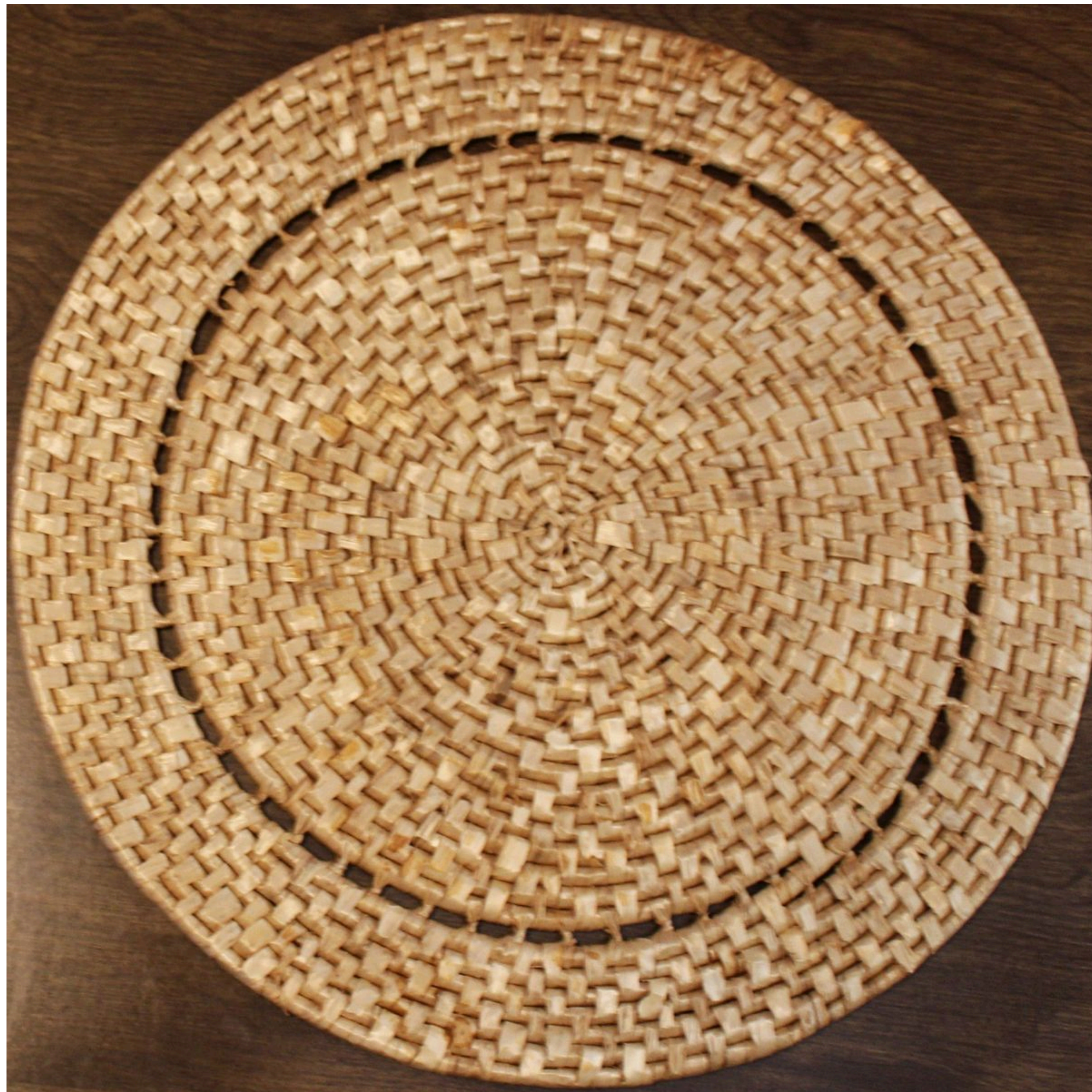
Entry - 14