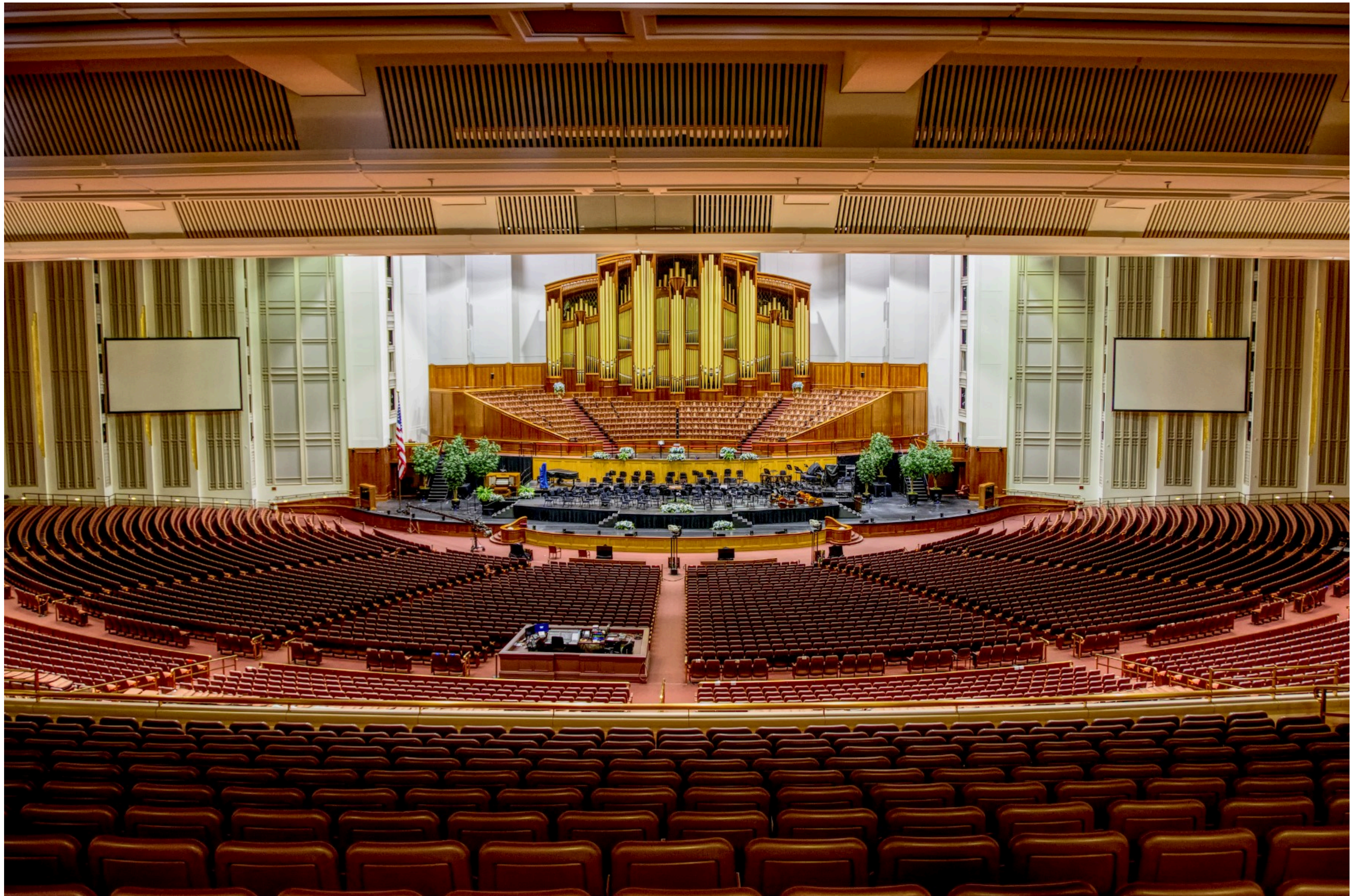
Entry - 6