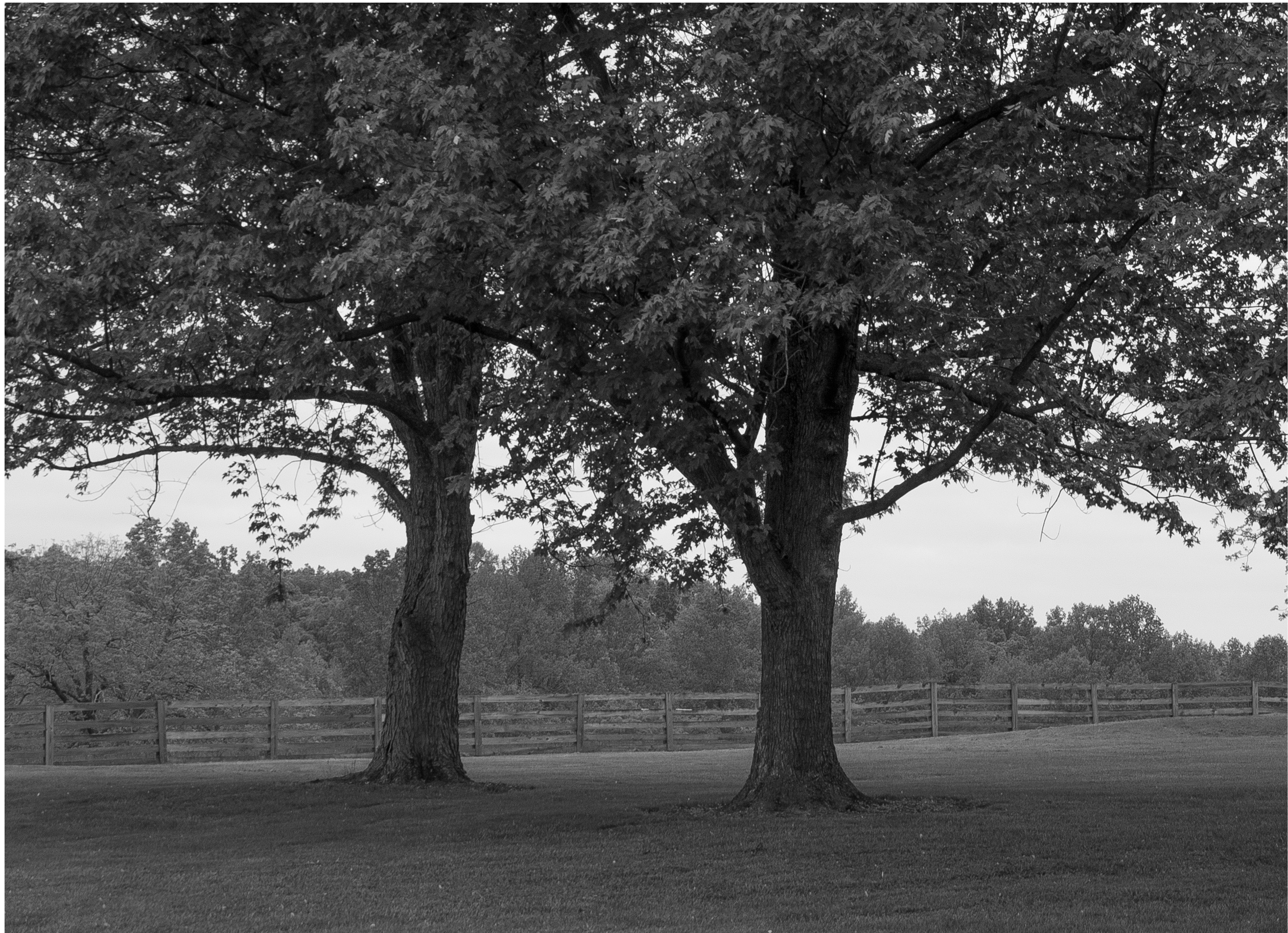
Entry - 2