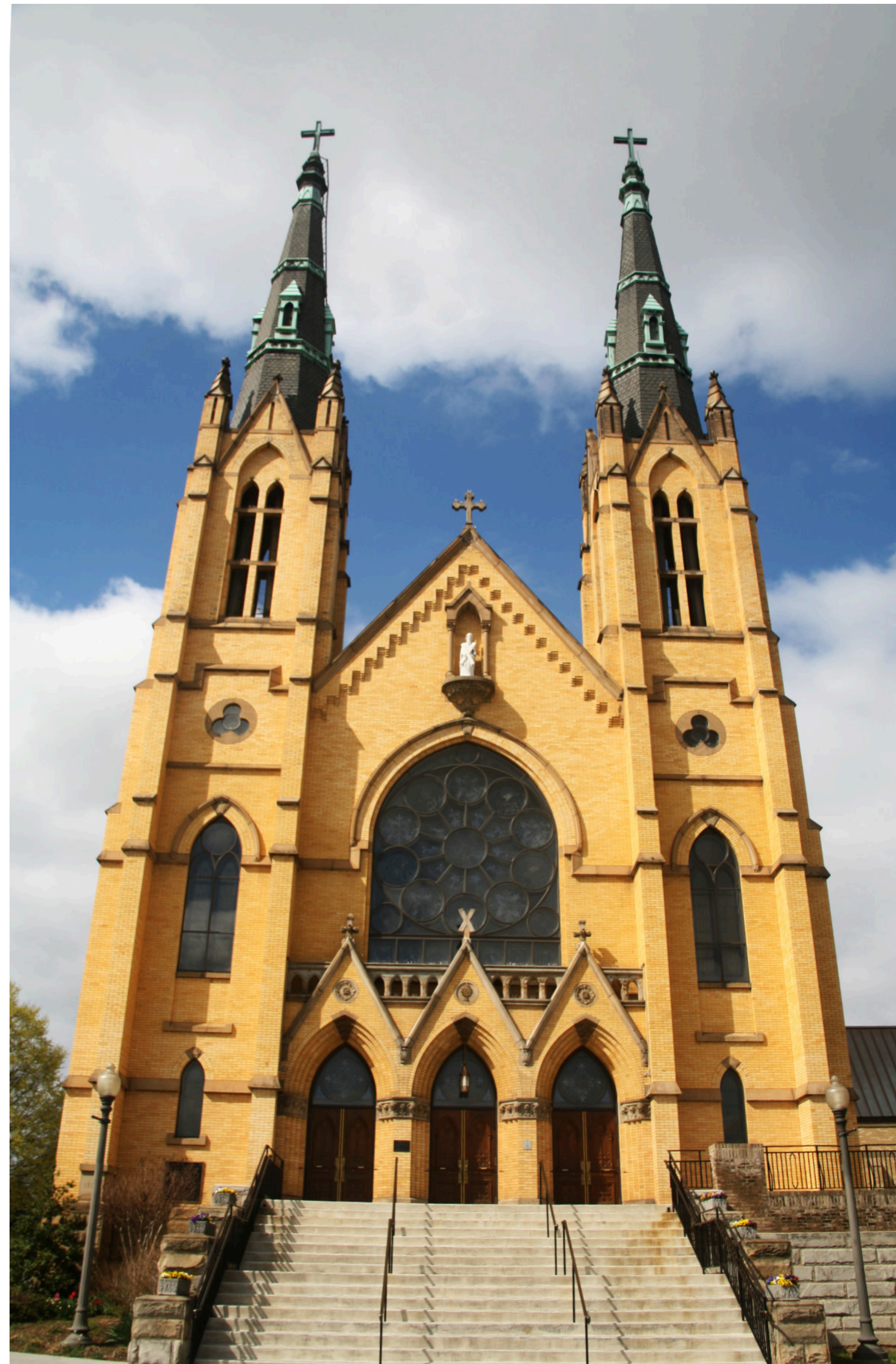
Entry - 11