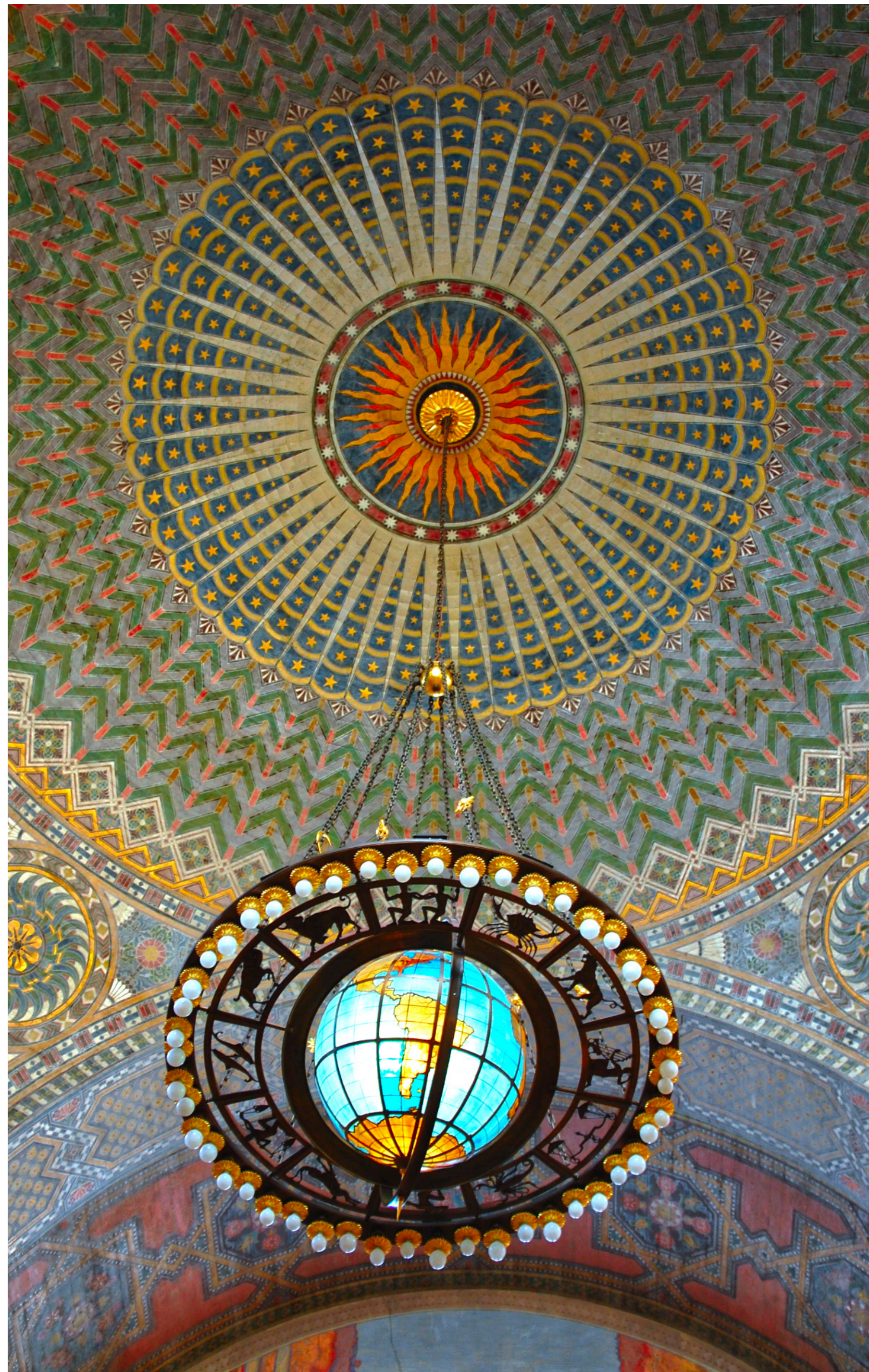
Entry - 13