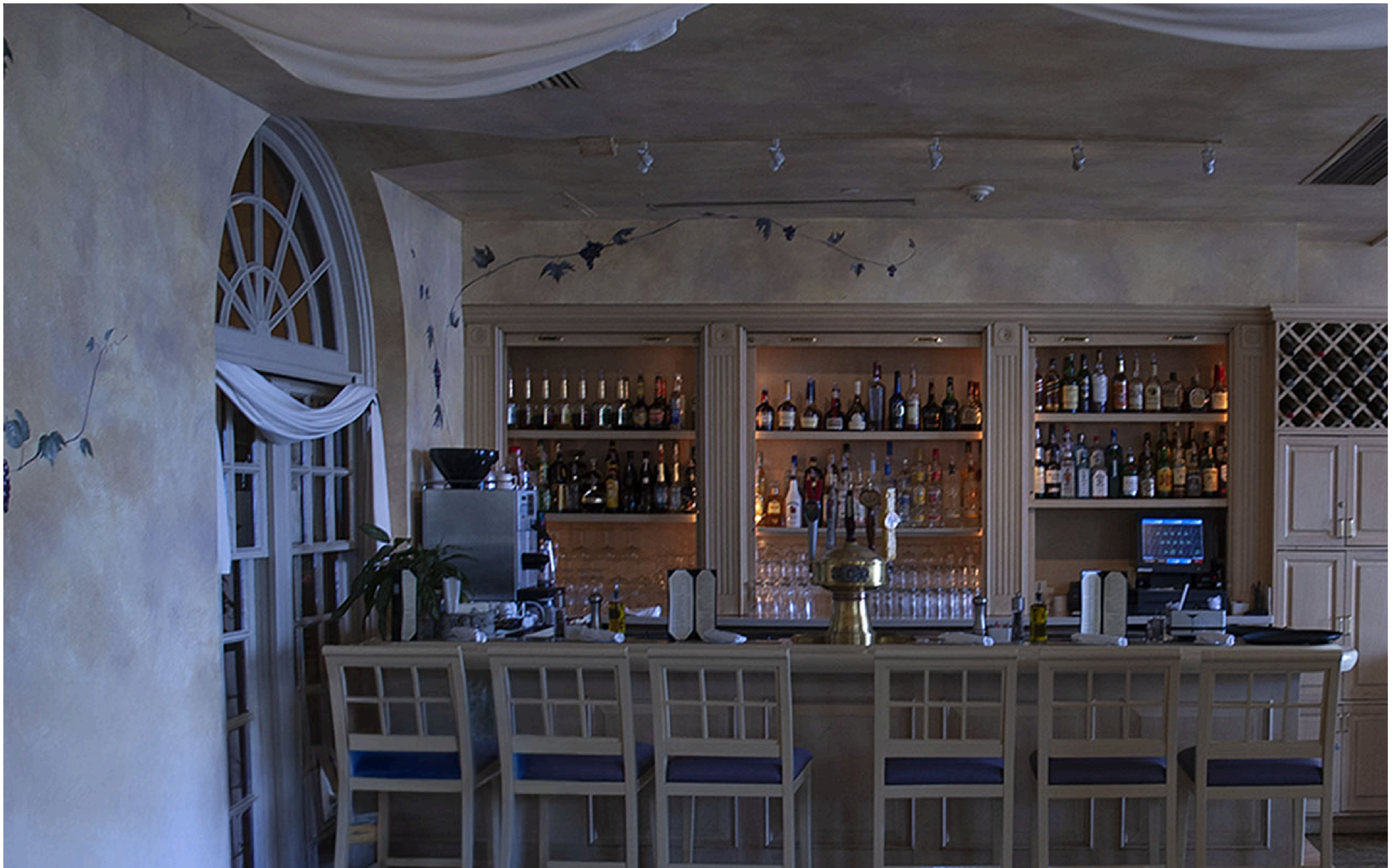
Entry - 3