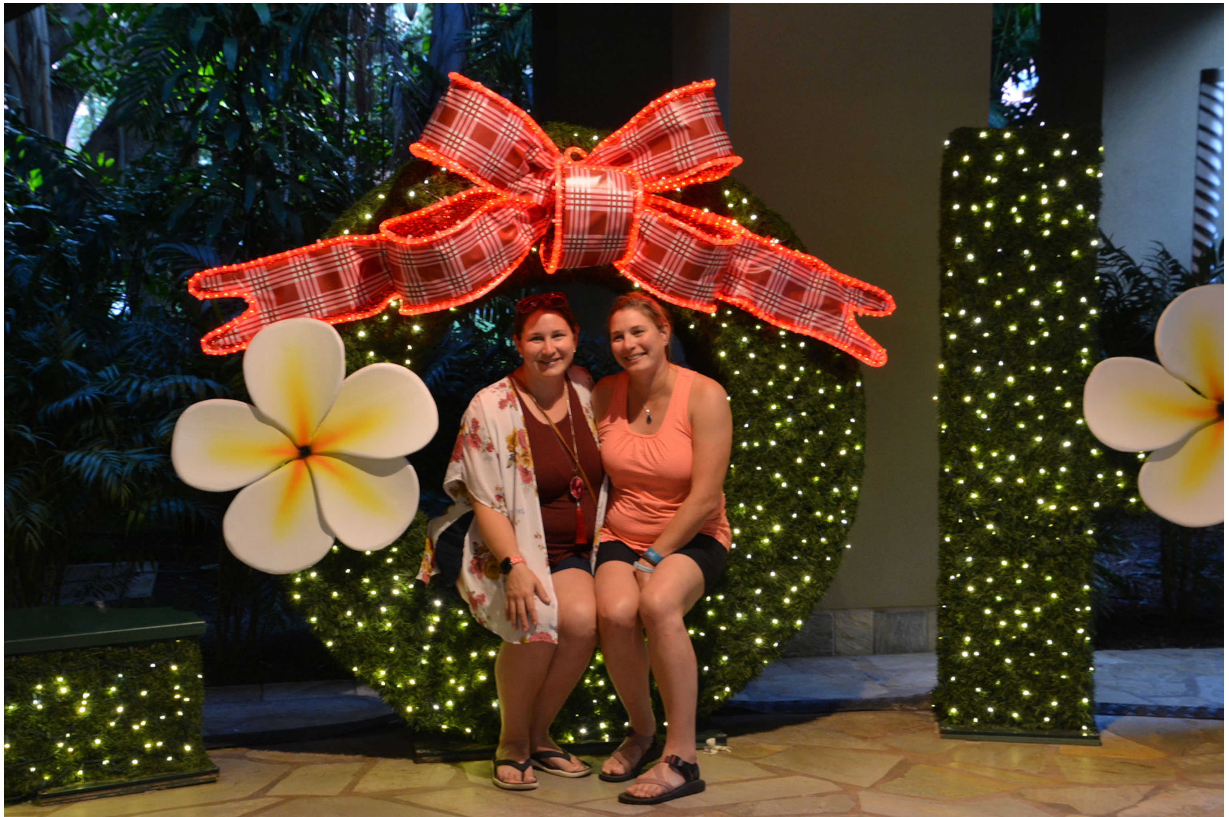
Entry - 5