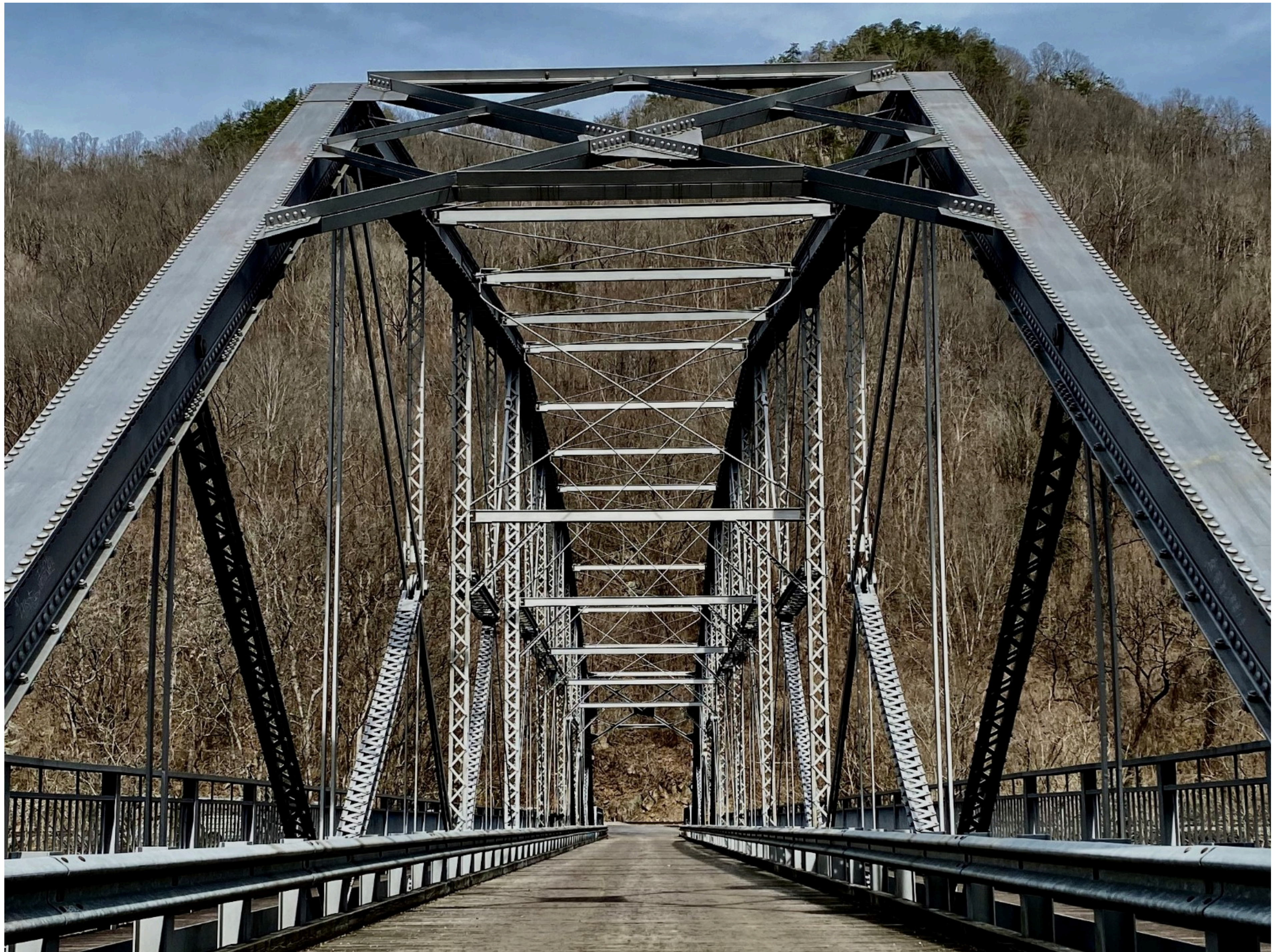
Entry - 8