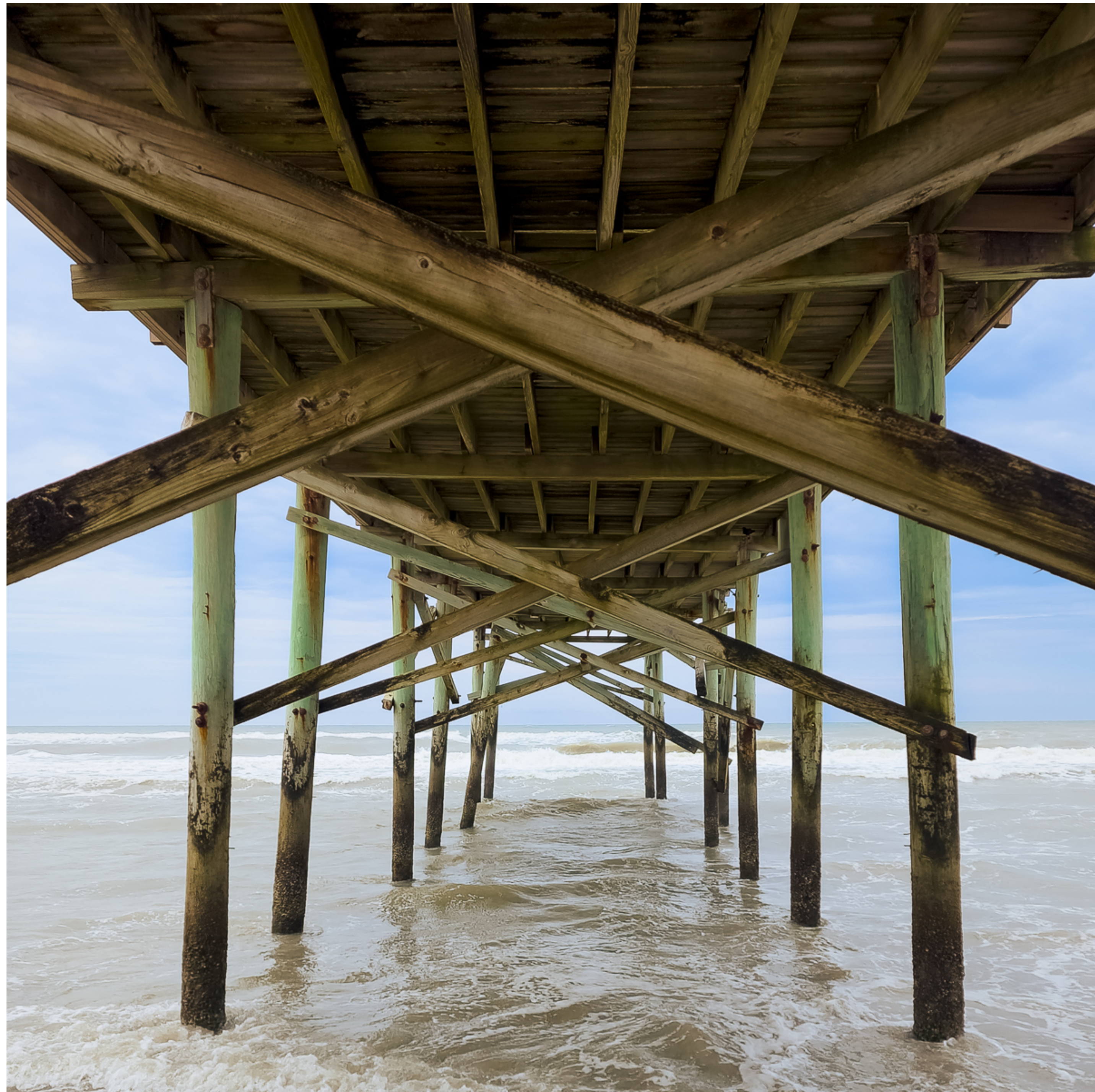
Entry - 12