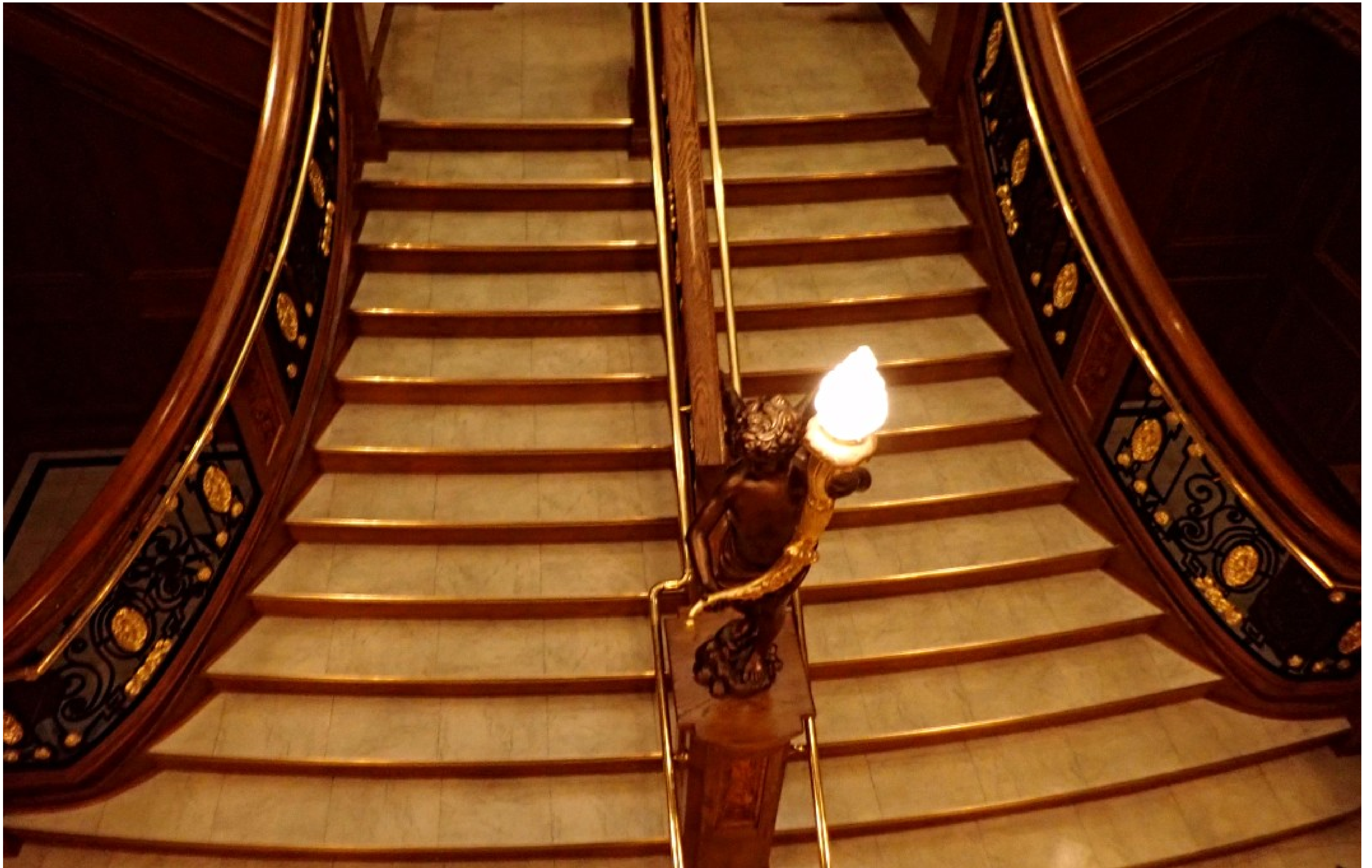
Entry - 1