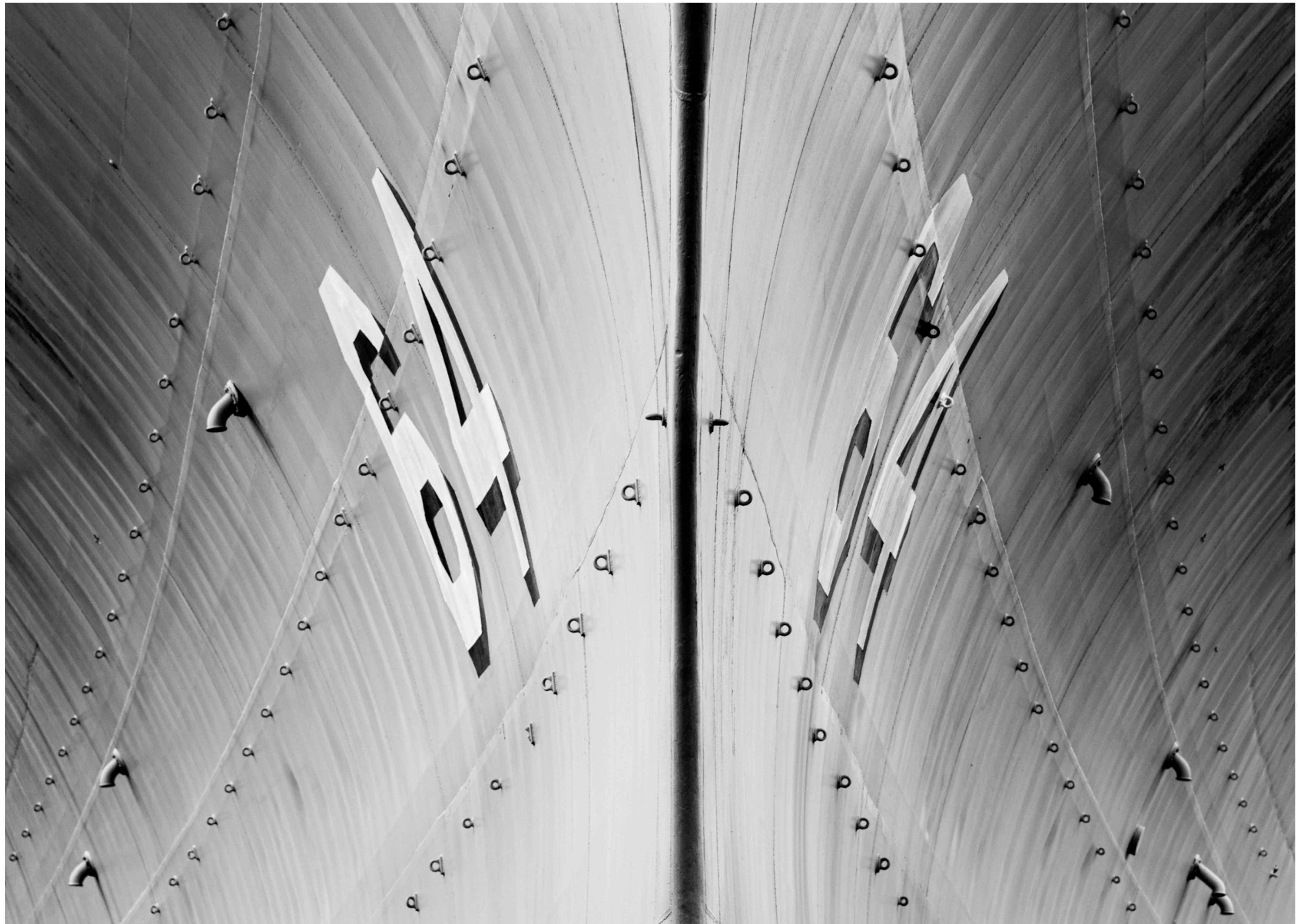
Entry - 9