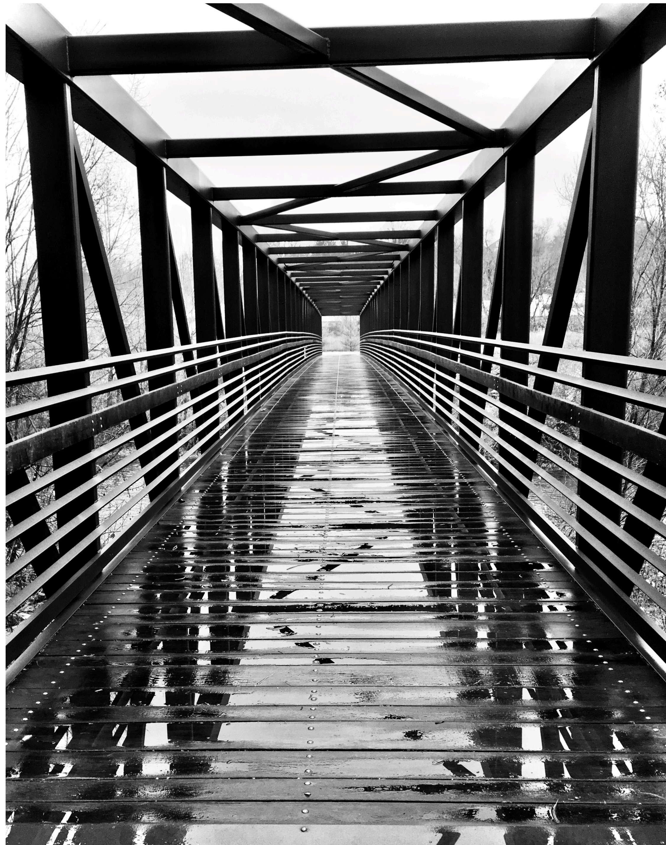
Entry - 10