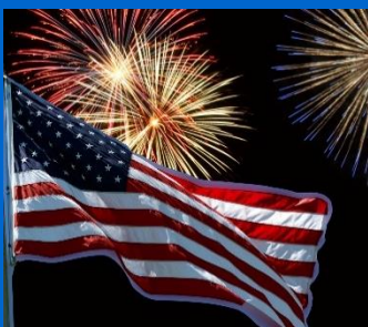
Happy 4 th of July