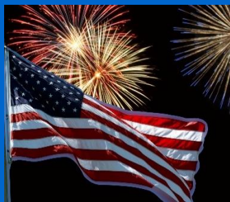
Happy 4 th of July