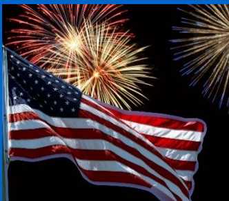
Happy 4 th of July