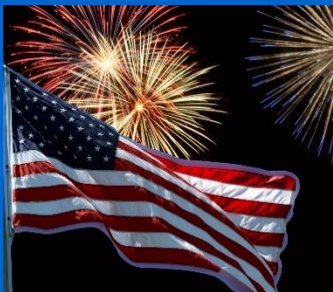
Happy 4 th of July