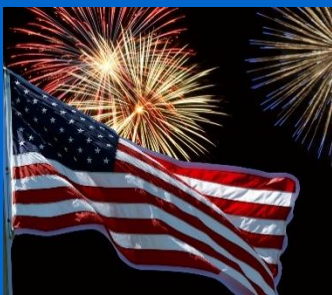
Happy 4 th of July