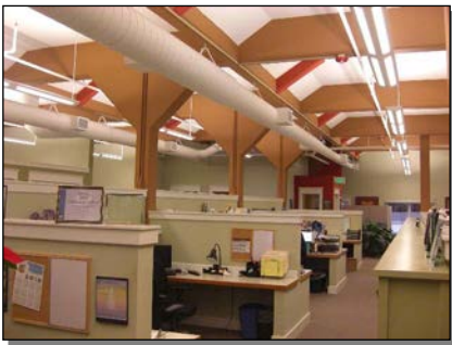
KAI Building Remodel