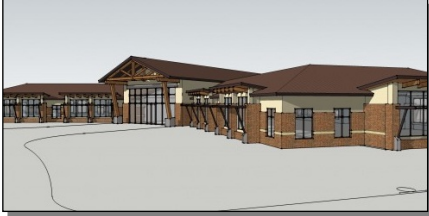
Enduris Office Building