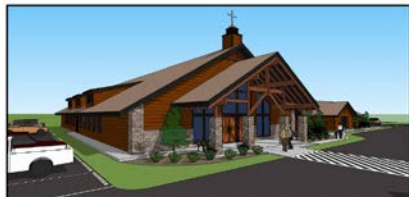
Trinity Bible Fellowship

Enduris Office/Conference Building Spokane, Washington