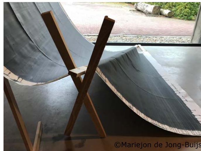
Untitled (Black) STOOK, De Steenfabriek, Gilze, The Netherlands, 2019