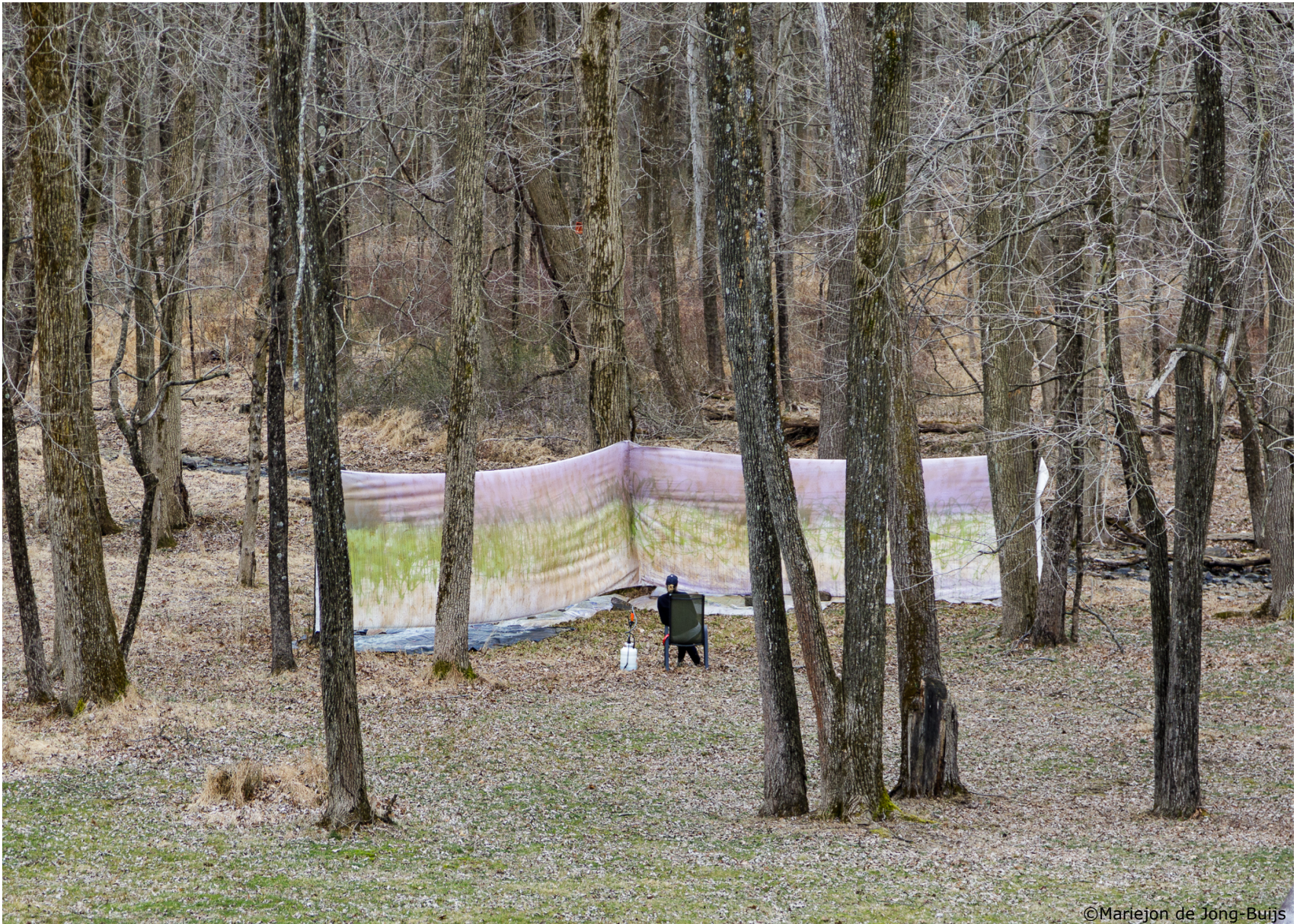
Hopewell Woods, outdoor project 2020