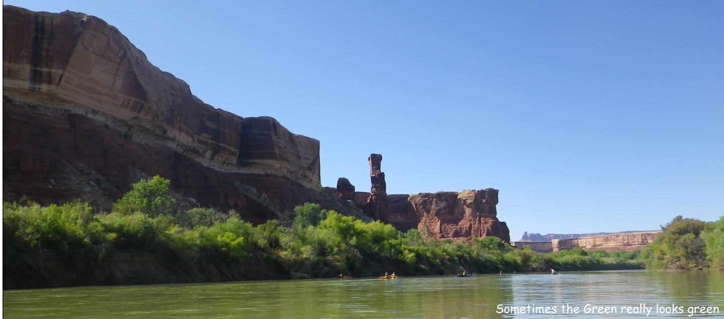
Sometimes the Green really looks green

The lower portion of the Green, often referred to as Stillwater Canyon, goes from Mineral Bottom to the Confluence. People paddling that section, or the Colorado River southwest of Moab, hire a jet boat to shuttle them back to town.