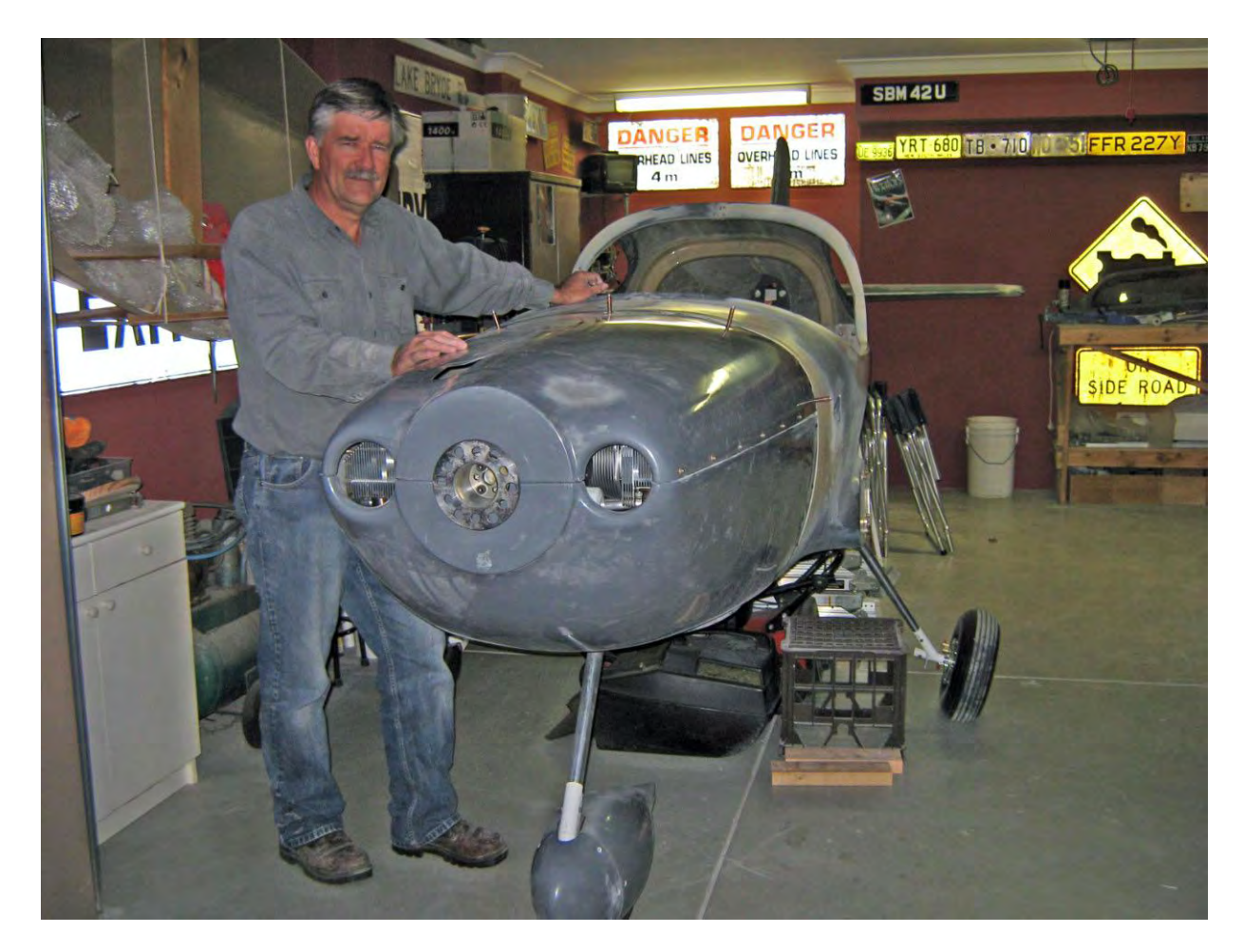
Latest photo - just finishing the cowls

Joining a club or association: I would still definitely recommend joining an aircraft builder's club, even if you complete a home build. Our club has over 300 members ranging from old lads with 20,000 hours on DC3's to youngsters who have just discovered aviation. We have first time builders and repeat offenders – some of whom are on their 9<sup>th</sup> or 10<sup>th</sup> aircraft. The collection knowledge is substantial and invaluable – ranging from where to source hard to find bits-and-pieces through to how to set-up radios and an antenna that actually works properly! I continually learn (the education side of the equation again!) building tips from those who have gone before me. This makes my plane better built and saves me much experiment/discovery time when building.