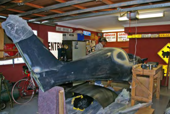
Opening up the crate – discovering all the kit parts!