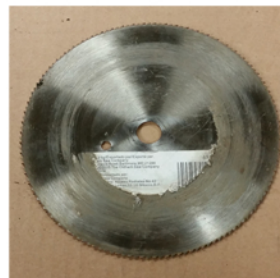
Cut off Wheel