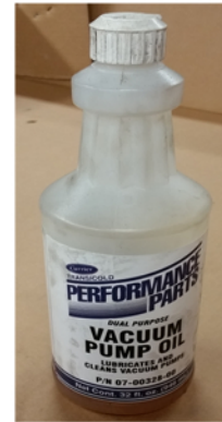
Vacuum Pump Oil