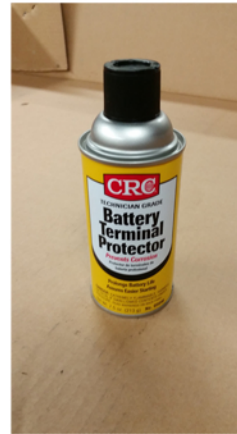
Battery Protector Spray