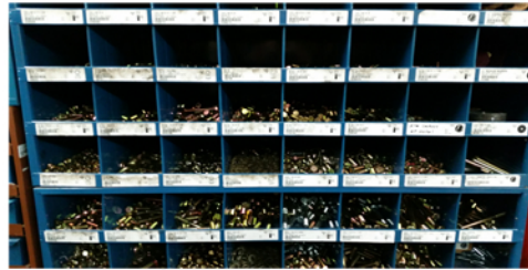
Misc. Nuts & Bolts