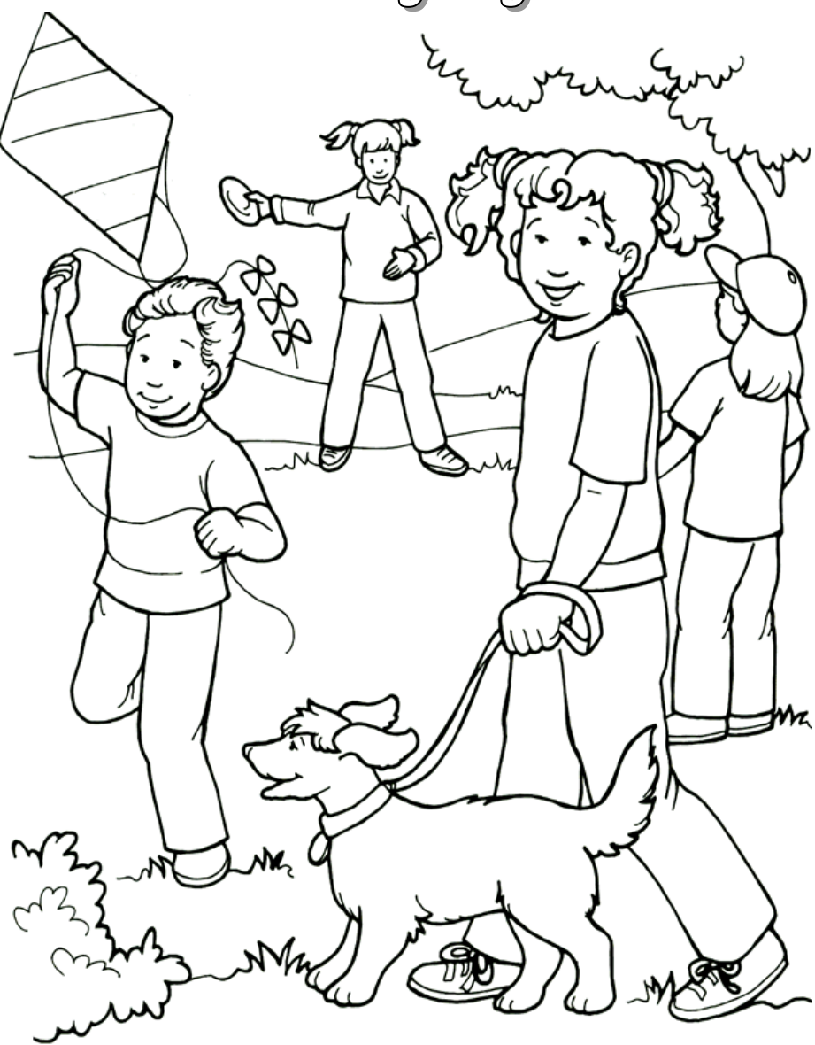
Jesus Loves Everyone

From Thru-the-Bible Coloring Pages for Ages 4-8. © 1986,1988 Standard Publishing. Used by permission. Reproducible Coloring Books may be purchased from Standard Publishing, www.standardpub.com, 1-800-543-1301.