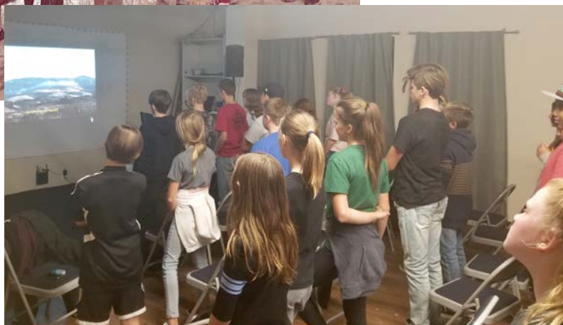
Upper right: Hike to the cross at Catalina. Remaining photos: Youth group on Wednesday nights.