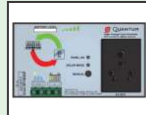
HOME INVERTER TO SOLAR CONVERSION