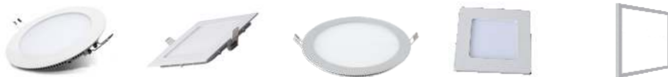
SLIM ROUND - S 3W 6W 12W 15W 20W