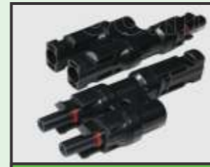
MC4 T BRANCH CONNECTORS