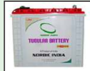
C10 SOLAR BATTERIES