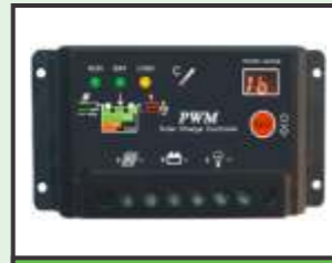
SOLAR CHARGE CONTROLLERS