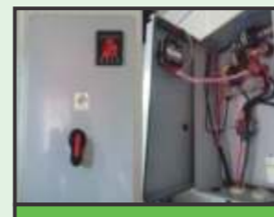
AC DISTRIBUTION BOX WITH ENERGY METER