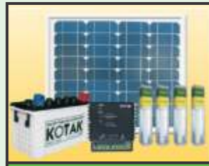
DC HOME LIGHTING SYSTEM