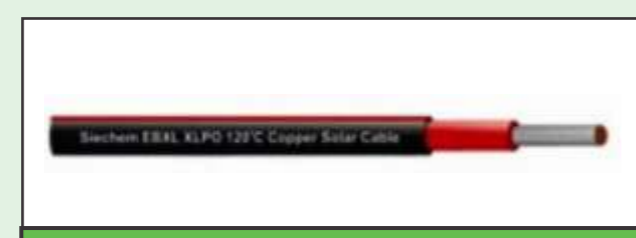
SOLAR DC CABLE 2.5 4 and 6 Sq. mm TUV CERTIFIED & UV RATED