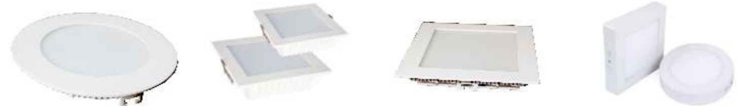
SLEEK BACKLIT ROUND 9W 18W