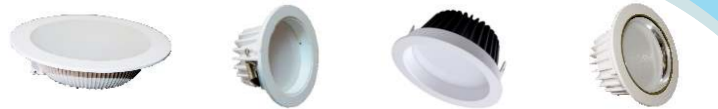
WAVES DOWN LIGHT 7W 12W 18W 24W