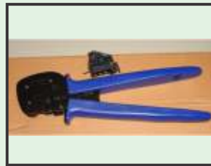
MC 4 CRIMPING TOOL