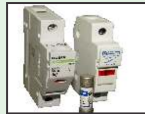
DC FUSE & HOLDER