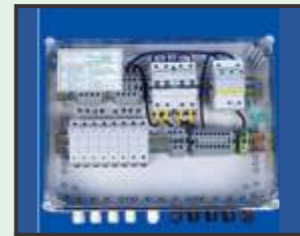
DC COMBINER BOXES