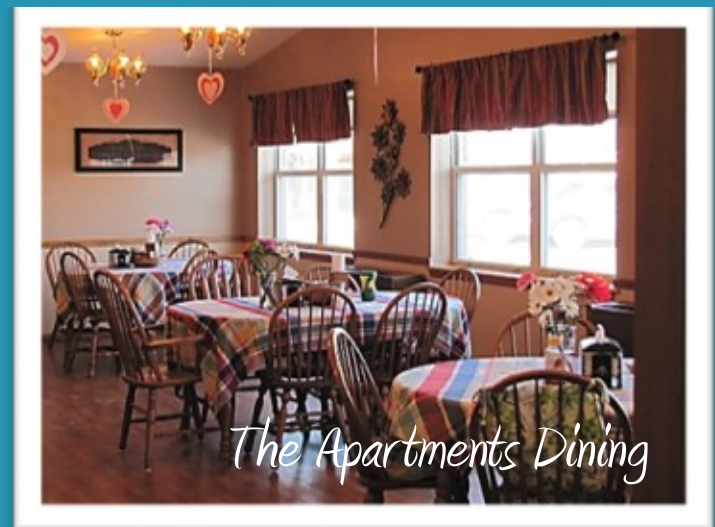
The Apartments Dining