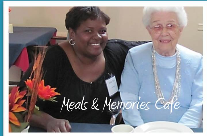
Meals & Memories Cafe

We get compliment after compliment on our excellent food throughout our community.