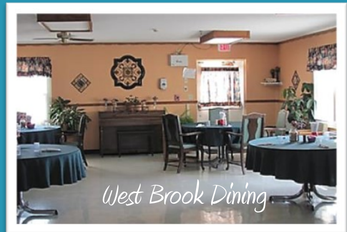
West Brook Dining