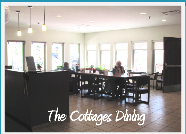
The Cottages Dining