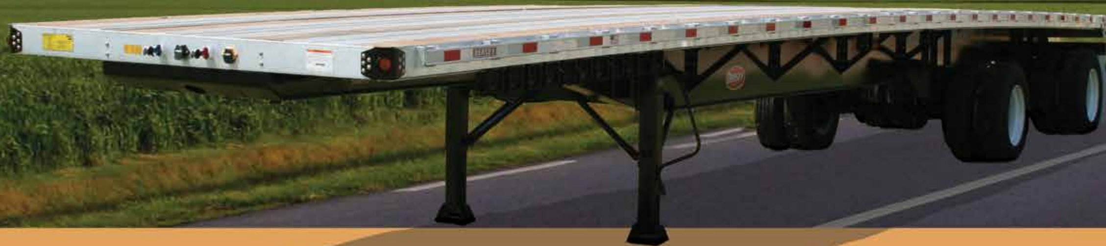
MODEL: FC - 48

Today, Dorsey's vision remains the same.