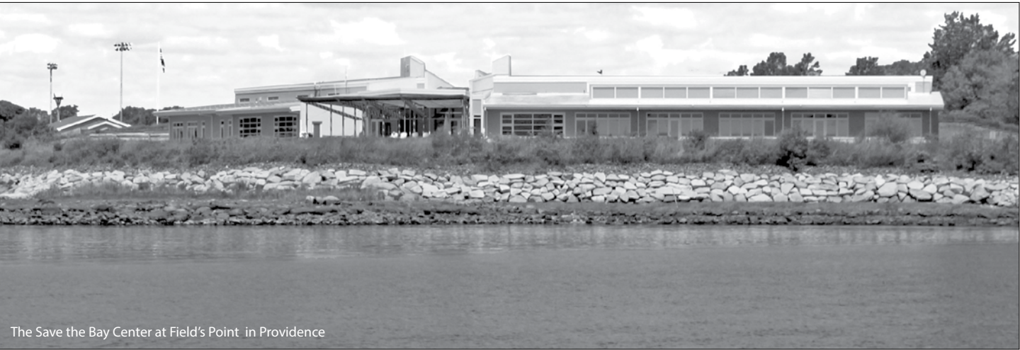
The Save the Bay Center at Field’s Point in Providence

He said at the time, “I want to help make Rhode Island a place where people want to put down roots, to feel like their children will get a first rate education, and that their government works not just for special interests but for all Rhode Islanders.” ❖