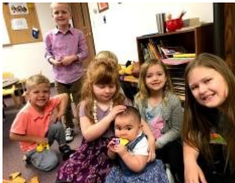
Kids having fun in the nursery on a recent Sunday morning

The nursery is an important part of our ministry to families with young children. Adults and high school students are needed to staff the nursery during Sunday services each week. Please sign up in the fellowship hall if you are able to help in the nursery this summer. Thank you for serving in this important way! If there is no one listed on the sign-up sheet, the nursery will not be staffed that day, but parents are always welcome to use the nursery with their children at any time.