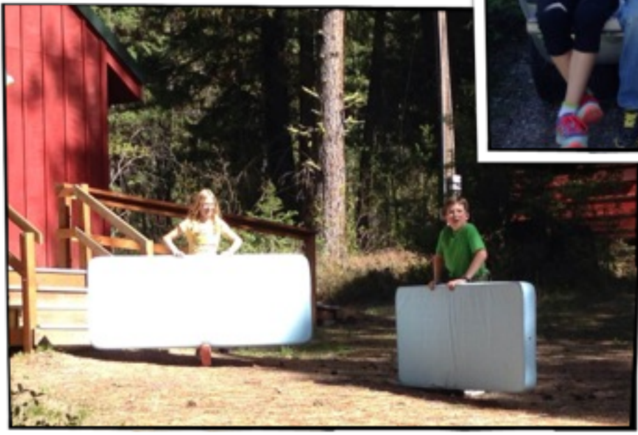
Camp Cascade Work Weekend (May 18-19) had a great team assemble with the Silva and Moody-St. Claire kids helping to distribute mattresses to all the cabins and sweeping everything out.