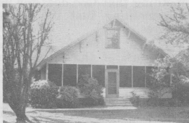
The Davis Home